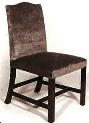
#29 SIDE CHAIR 22" W X 24½" D X 39½" H Illustrated in mahogany. Requires 1¾ yds. of 50" plain fabric.