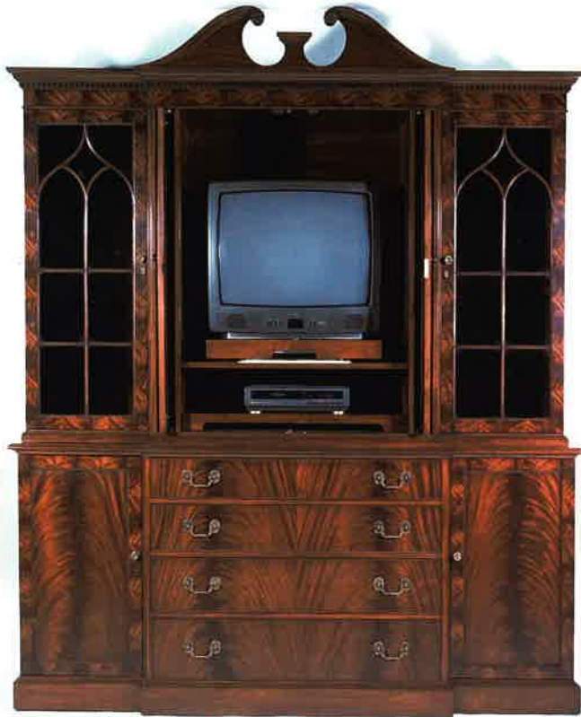
#5010AV AUDIO VISUAL CABINET 84"W x 28"D x 86"H Interior illustrated with pull out swivel television shelf and VCR shelf.