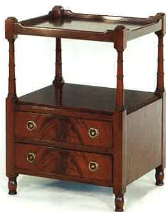
#4135 NIGHT TABLE 19"W X 16"D X 25"H Illustrated in mahogany and crotch mahogany.