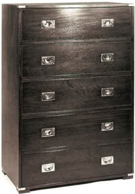
#223 MILITARY HIGH BOY 36"W x 20"D x 53"H Illustrated in mahogany.