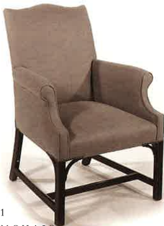
#2061 ARMCHAIR 26¼" W x 27¼" D x 39½" H Illustrated with mahogany show wood and scroll arm. Requires 3¼ yds. of 50" plain fabric.