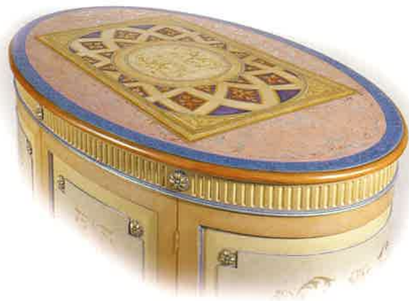
Detail of top inlay.