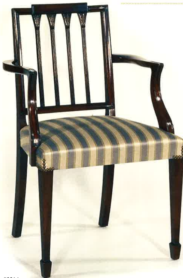
#2014 CARVED STICK BACK ARMCHAIR 22½" W x 21" D x 35½" H Illustrated in mahogany with hand carving. Requires ¾ yd. of 50" plain fabric.