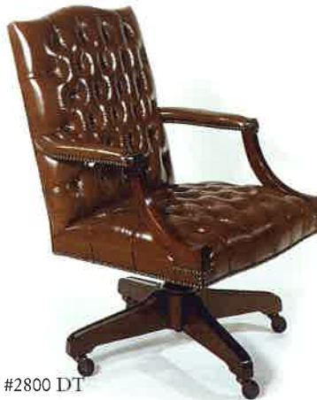
#2800 DT SWIVEL CHAIR 25" W x 21" D x 41" H Illustrated in mahogany with diamond tufted upholstery. Supplied with a five-prong base. Requires 2½ yds. of 50" plain fabric.