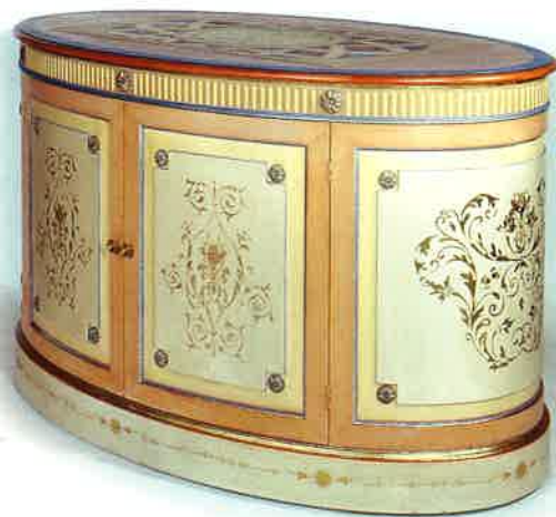
T.V. CABINET 62"W x 36"D x 35½"H Illustrated in custom paint finish. Rectangular top panel raises on custom T.V. lifter.