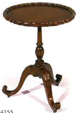
#4155 PEDESTAL TABLE 18"DIA X 22"H Illustrated with piecrust edge and hand carved legs.