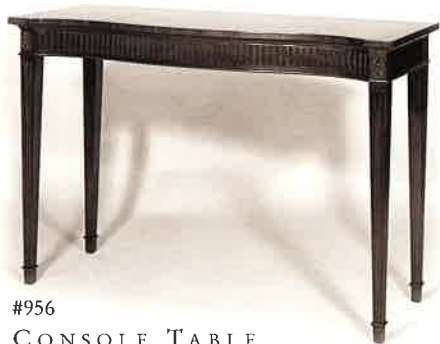
#956 CONSOLE TABLE 36"W X 12"D X 30"H Illustrated in mahogany with satinwood borders.