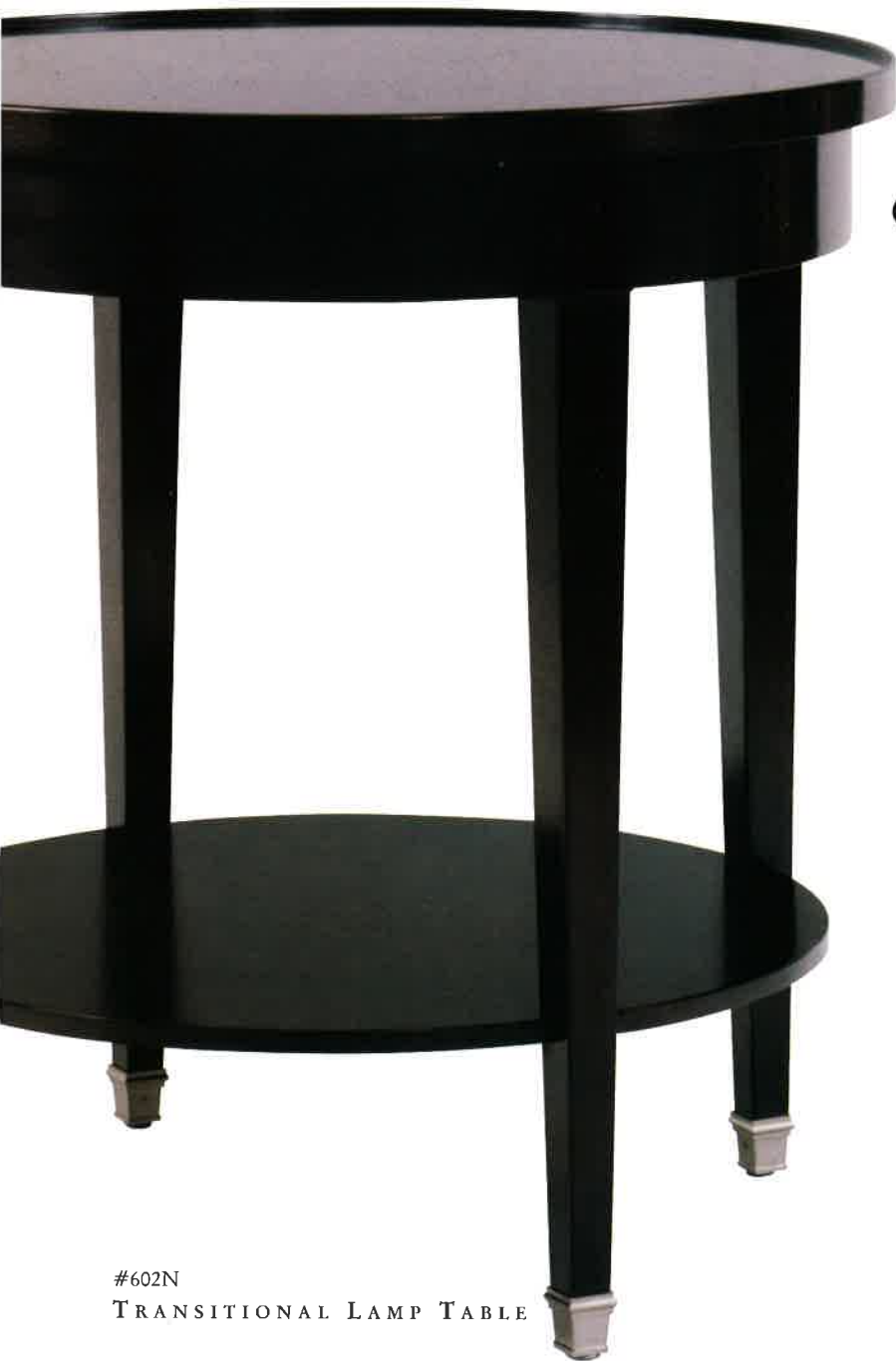
#602N TRANSITIONAL LAMP TABLE

Guildhall has created some of the finest period style furniture for over 55 years. In the box below is an elegant example from our catalogue of close to 500 images that we offer to the Trade. The Lamp Table is made of mahogany with a beautiful inlay on the apron and solid brass feet. As always the finish is Guildhall's hand applied French polish - a finish that only improves with time.