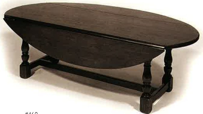
#460 DROP LEAF COFFEE TABLE 54"W X 34½"D X 17"H (closed 54"W X 16½"D X 17"H) Illustrated in oak.