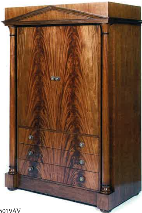
#5019AV BIEDERMEIER AUDIO VISUAL CABINET 48"W X 27"D X 76"H Illustrated in mahogany with crotch mahogany faces.