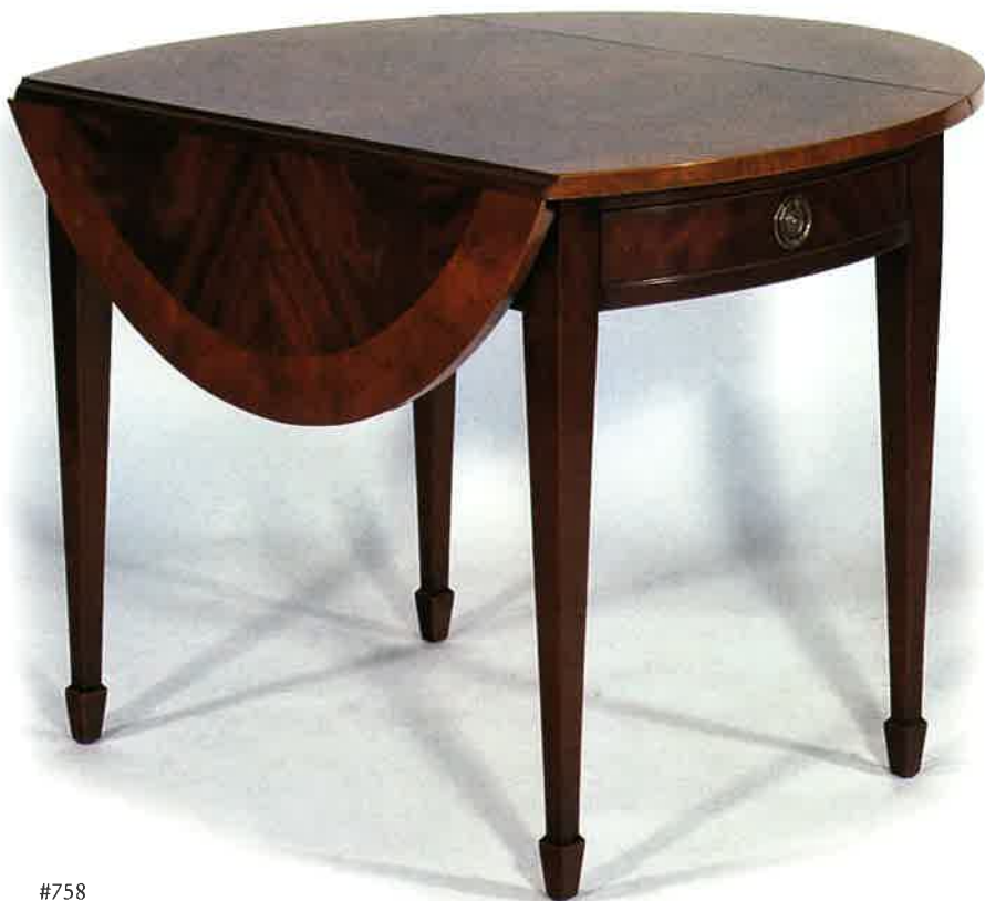
#758 PEMBROKE TABLE 39"W X 32"D X 24"H leaves up (20"W with leaves down) Illustrated in mahogany with four piece crotch mahogany top with yew-wood crossbanding.