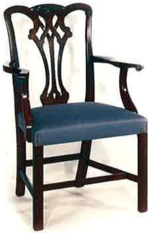
#17 CHIPPENDALE ARMCHAIR 22½" W x 21" D x 38" H Illustrated in mahogany with hand carving. Requires ¾ yd. of 50" plain fabric.