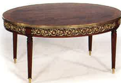
#4376 OVAL COFFEE TABLE 39"W X 32"D X 18"H Illustrated in mahogany with crotch mahogany top with yew-wood border and brass ormolu.