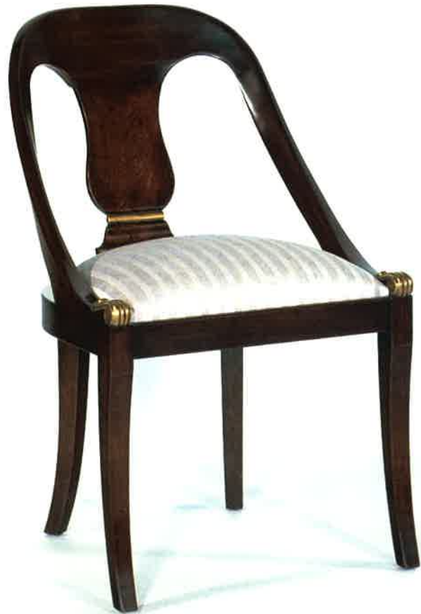
#2006 EMPIRE CHAIR 21"W X 22½"D X 34"H Illustrated in mahogany with hand carving and gilt trim. Requires 1½ yds. of 50" plain fabric.