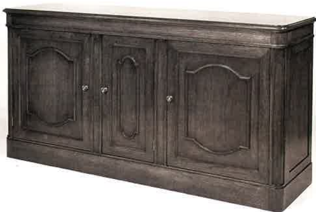
#211 SIDEBOARD 65"W x 18"D x 33"H Illustrated in walnut.