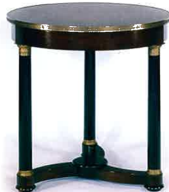
#908 EMPIRE LAMP TABLE 26" DIA X 26½" H Illustrated in mahogany with ebonized columns.