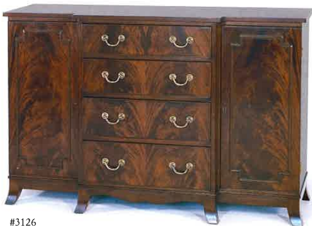
#3126 BREAKFRONT SIDEBOARD 52"W x 18"D x 34"H Illustrated in mahogany with crotch mahogany faces.