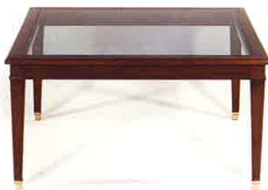
#4195 C O F F E E T A B L E 33"W x 33"D x 17"H Illustrated in walnut with tinted inset glass top.