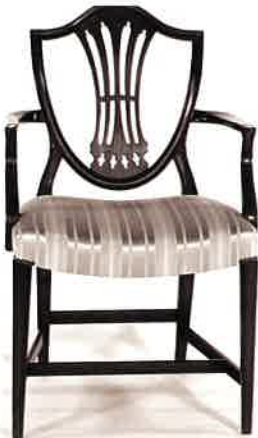
#2012 HEPPELWHITE SHIELD BACK ARMCHAIR 22½" W x 19" D x 38½" H Illustrated in mahogany. Requires ¾ yd. of 50" plain fabric.