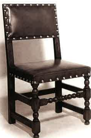
#444 SIDE CHAIR 19"W x 17"D x 35 \frac{1}{2} "H Illustrated in oak with oversized nail heads. Requires 1 \frac{1}{3} yds. of 50" plain fabric.