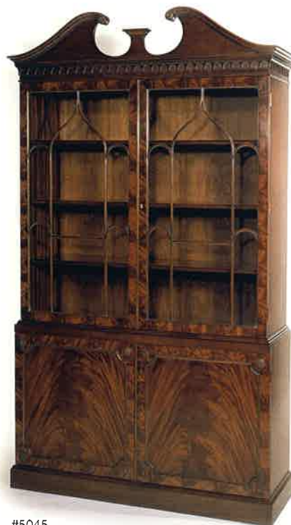
#5045 BOOKCASE 48"W x 16"D x 84"H Illustrated in mahogany and crotch mahogany with pediment.