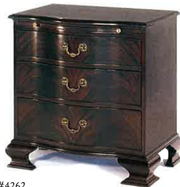
#4262 MINIATURE CHEST 27"W X 18"D X 25"H Illustrated in mahogany with crotch mahogany drawer faces. Pull out shelf shown above the drawers.