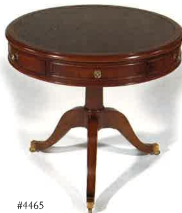
#4465 DRUM TABLE 29½"D X 25½"H Illustrated in mahogany, leather top and one operating drawer. Also available in 24" diameter and wood top.