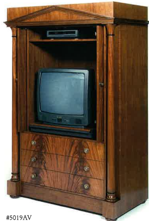
#5019AV BIEDERMEIER AUDIO VISUAL CABINET 48"W X 22"D X 76"H Interior illustrated with pull-out swivel television shelf and VCR shelf above.