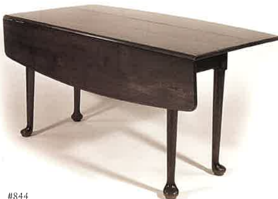
#844 DROP LEAF TABLE 60"L X 44"W X 29"H Illustrated in oak. Closed size 60" x 21" x 29".