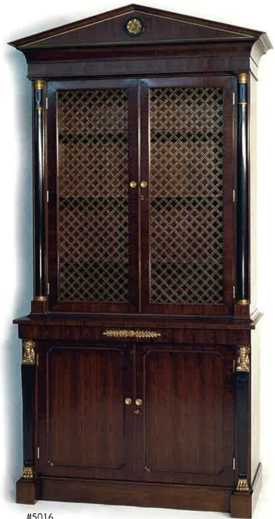
#5016 EMPIRE CABINET 40" W x 20" D x 88" H Illustrated in mahogany and rosewood with ebonized columns and brass fittings.