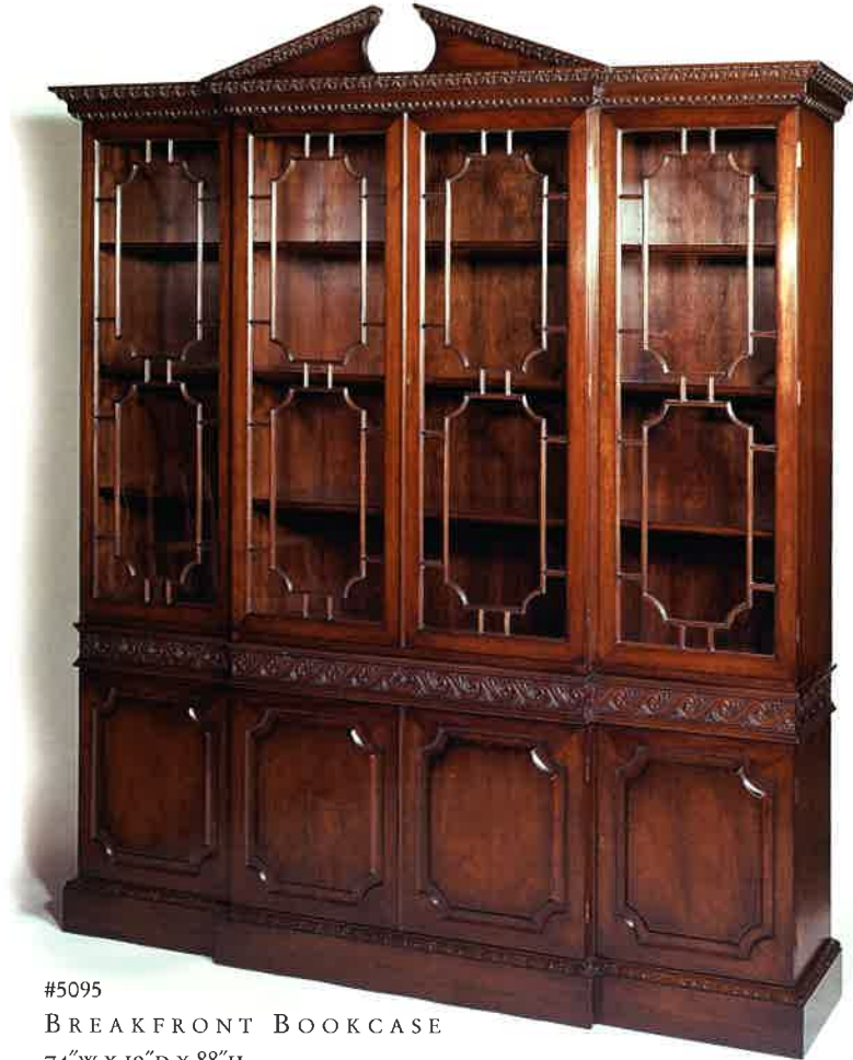
#5095 BREAKFRONT BOOKCASE 74"W x 19"D x 88"H Illustrated in mahogany with hand carved pediment, frieze, apron and base.