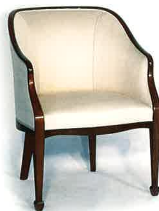
#2021 TUB CHAIR 25" W X 20½" D X 34" H Illustrated in mahogany. Requires 3 yds. of 50" plain fabric.