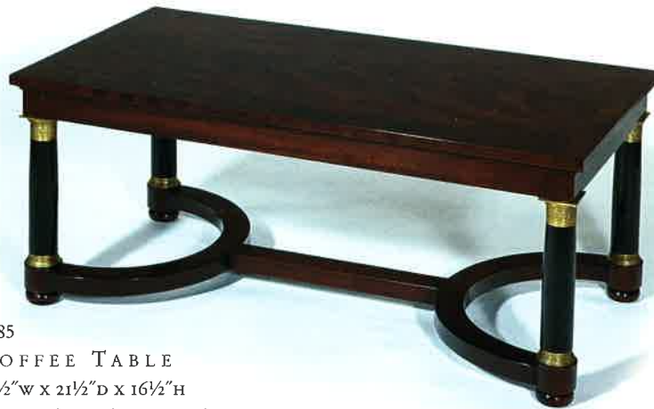
#385 COFFEE TABLE 41½" W X 21½" D X 16½" H Illustrated in mahogany with crotch mahogany and rosewood.