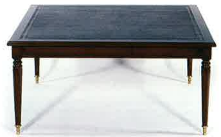
#292A COFFEE TABLE 38"W X 38"D X 18"H Illustrated in mahogany with leather top.