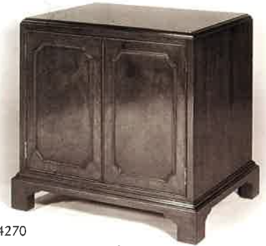
#4270 MINIATURE CHEST 23"W X 18"D X 23½"H Illustrated in mahogany with crotch mahogany door faces.