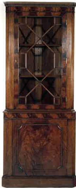
#5043 CORNER CABINET 31"W x "D x 75½"H Illustrated in mahogany and crotch mahogany.