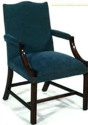
#2040 ARMCHAIR 25" W X 27½" D X 39" H Illustrated in mahogany with upholstered arm. Requires 1¾ yds. of 50" plain fabric.