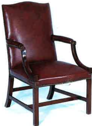
#32 BOARDROOM ARMCHAIR 25" W X 28½" D X 40¾" H Illustrated in mahogany with line of brass nails. Requires 2½ yds. of 50" plain fabric.