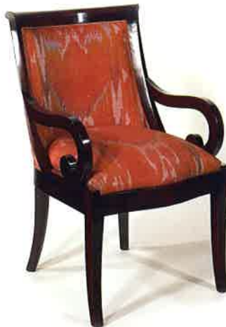
#2195 EMPIRE ARMCHAIR 22"W X 26¾"D X 35¾"H Illustrated in mahogany. Requires 2 yds. of 50" plain fabric.