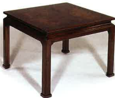
#4225 LAMP TABLE 30"W X 30"D X 22"H Illustrated in mahogany with four piece crotch mahogany top.