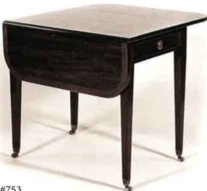
#753 PEMBROKE TABLE 40" W X 28" D X 26" H Illustrated in mahogany with yew-wood crossband. (21 3/8" W X 28" D with flaps down)