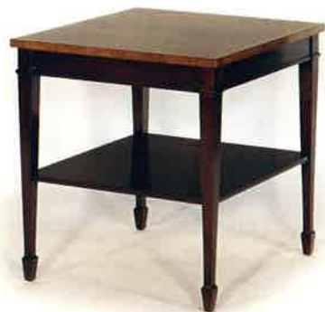
#4341B L A M P T A B L E 22"W x 22"D x 23"H Illustrated in mahogany with crotch mahogany top and satinwood borders.