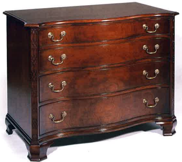
#5066 SERPENTINE CHEST 44"W x 23"D x 33½"H Illustrated in mahogany.