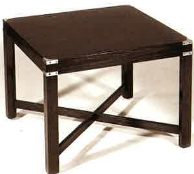
#4296 M I L I T A R Y O C C A S I O N A L T A B L E 27"W x 27"D x 20"H Illustrated in mahogany.