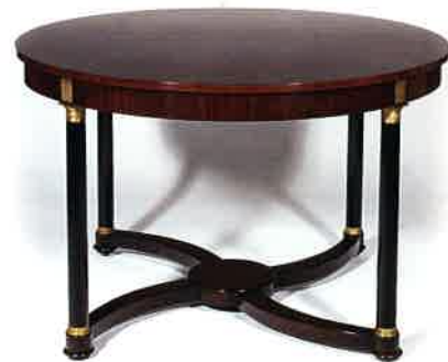
#6035 EMPIRE CENTRE TABLE 48" DIA x 30" H Illustrated in mahogany with rosewood crossbanding and ebony inlay. Rosewood apron with inserts of plaque azurée.