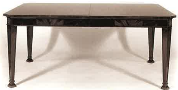
#942 DINING TABLE 66"L X 44"W X 29½"H plus 3 - 18" leaves (leaves not shown) Illustrated in mahogany with hand carved rosettes.