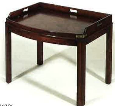
#4295 TEA TABLE 27 3/4" W X 21 3/4" D X 21 1/2" H Illustrated in mahogany.