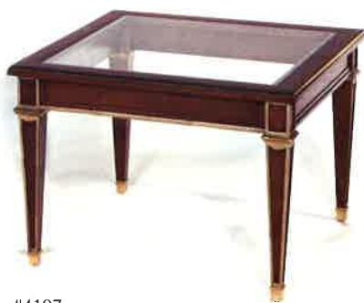
#4197 COFFEE TABLE 20"W X 20"D X 17"H Illustrated in walnut with french brasses, gilt trim and inset glass top. Usually sold in pairs.