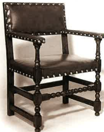
#444 ARMCHAIR 24"W x 18 \frac{1}{2} "D x 35 \frac{1}{2} "H Illustrated in oak with oversized nail heads. Requires 1 \frac{1}{3} yds. of 50" plain fabric.