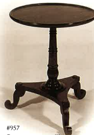
#957 PEDESTAL TABLE 16"DIA X 20"H Illustrated in walnut.