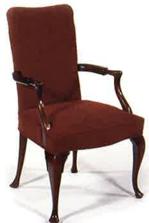
#2170 ARMCHAIR 25" W X 26¼" D X 42½" H Illustrated in mahogany with hand carving. Requires 2¼ yds. of 50" plain fabric.