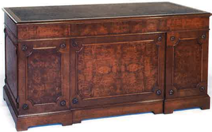
#3175 DOUBLE PEDESTAL DESK 60"W X 30"D X 30"H View of visitor's side.