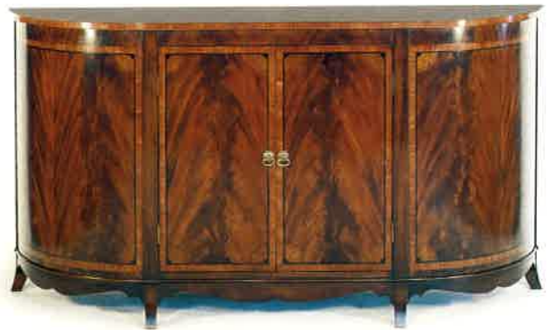
#5061 COMMUNE 60"W X 16"D X 32"H Illustrated in mahogany with crotch mahogany and inlays.