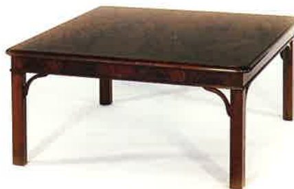
#4212 COFFEE TABLE 36"W X 36"D X 17"H Illustrated in mahogany with four piece crotch mahogany top and crotch mahogany apron.