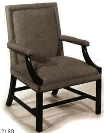
#2180 ARMCHAIR 27" W X 27¾" D X 39" H Illustrated in mahogany with upholstered arm with detail in back. Requires 2½ yds. of 50" plain fabric.