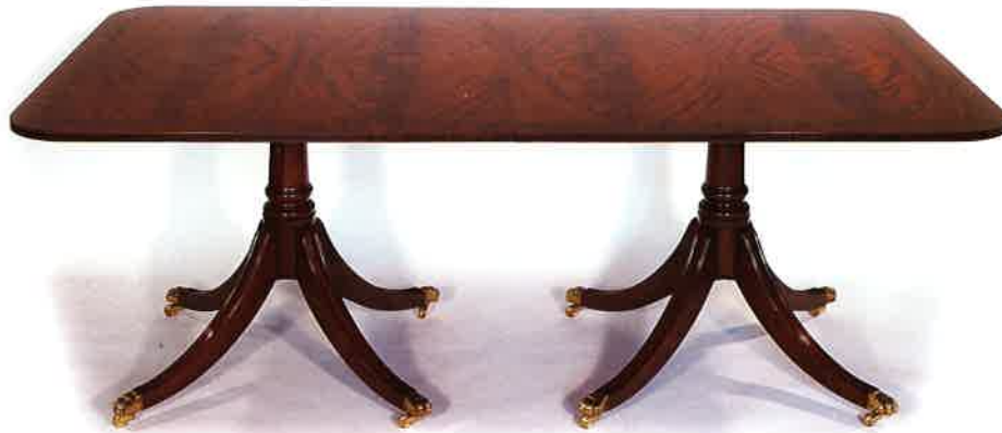
#945 TWO PEDESTAL DINING TABLE 78" L x 44" W x 29 1/4" H plus 3 - 18" leaves (leaves not shown) Illustrated in mahogany with four sweeps per pedestal. Solid brass lion's claw feet with casters. Crotch mahogany top with rosewood crossbanding, inlaid ebony line and rosewood edge. Custom sizes available.