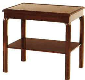
#4245 LAMP TABLE 18"W X 26"D X 23"H Illustrated in mahogany.