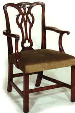
#6 CHIPPENDALE ARMCHAIR 23" W x 23" D x 38½" H Illustrated in mahogany with hand carving. Requires ¾ yd. of 50" plain fabric.