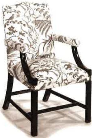
#2031 ARMCHAIR 23½" W X 27½" D X 39" H Illustrated in mahogany with upholstered arm. Requires 1¾ yds. of 50" plain fabric.