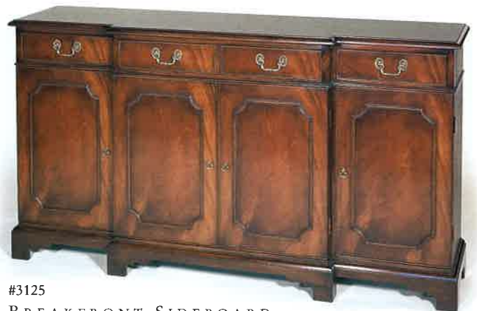
#3125 BREAKFRONT SIDEBOARD 60"W x 16"D x 33"H Illustrated in mahogany with crotch mahogany drawer and door faces.