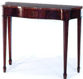
#4016 SERPENTINE CONSOLE TABLE 33"W x 15"D x 30"H Illustrated in mahogany with crotch mahogany top and apron with urn inlay in centre.