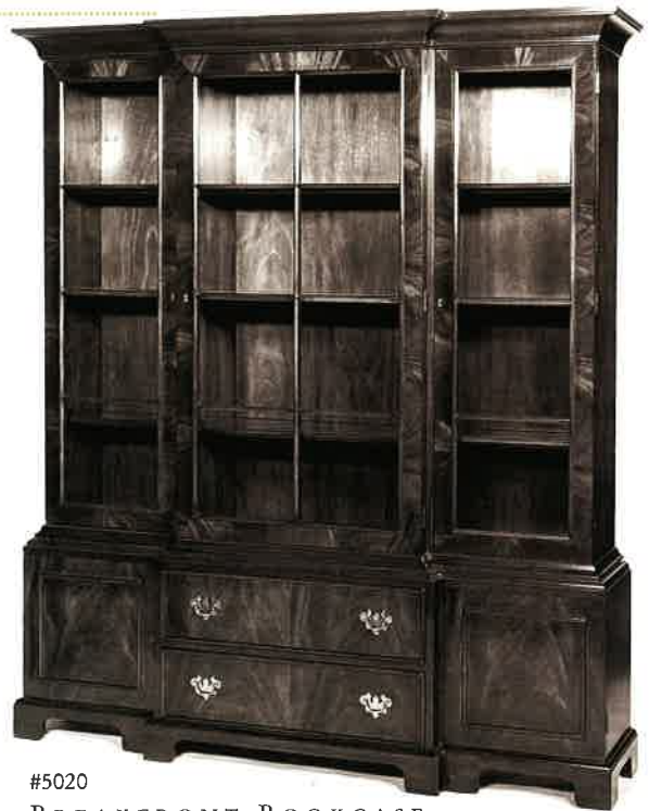
#5020 BREAKFRONT BOOKCASE 66"W x 16 \frac{1}{2} "D x 78"H Illustrated in mahogany and crotch mahogany faces and door frames.