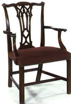
#14 CHIPPENDALE ARMCHAIR 24"W x 24"D x 39"H Illustrated in mahogany. Requires 3/4 yd. of 50" plain fabric.