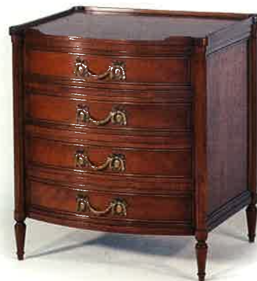
#4264 NIGHT TABLE 24"W X 18"D X 26"H Illustrated in mahogany.