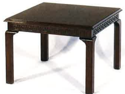
#4145 COFFEE TABLE 24"W X 24"D X 17"H Illustrated in mahogany with overlay fret.