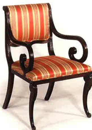
#1958K EMPIRE ARMCHAIR 22¼" W X 23½" D X 36½" H Illustrated in mahogany. Requires 1½ yds. of 50" plain fabric.