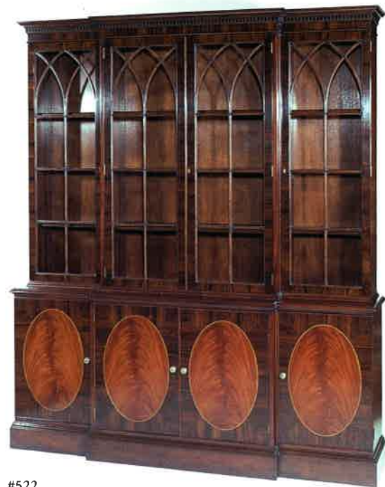
#522 BREAKFRONT BOOKCASE 76"W x 15½"D x 88"H Illustrated in mahogany with frieze and upper doors crossbanded with rosewood.