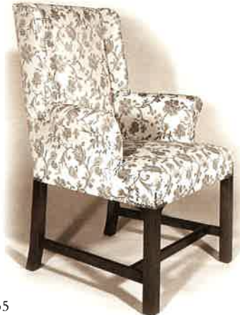
#35 ARMCHAIR 24½" W x 27½" D x 41" H Illustrated in mahogany with scroll arm and wings. Requires 4 yds. of 50" plain fabric for the tight seat, or 5¼ yds. for the cushion seat.