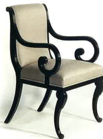
#1958 EMPIRE ARMCHAIR 22¼" W X 23½" D X 36½" H Illustrated in mahogany. Requires 1¾ yds. of 50" plain fabric.