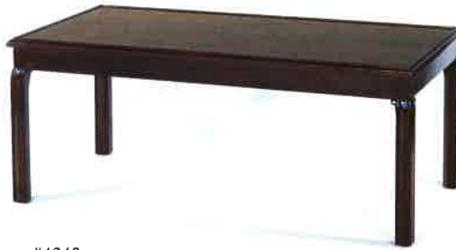
#4240 CHIPPENDALE COFFEE TABLE 44" W X 22" D X 17 1/2" H Illustrated in mahogany.