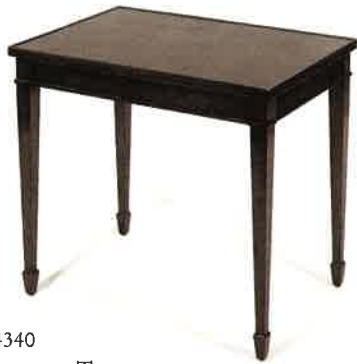
#4340 LAMP TABLE 26" W X 18" D X 23" H Illustrated in mahogany with inlaid border.