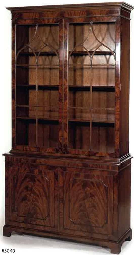
#5040 BOOKCASE 45" W x 16½" D x 84" H Illustrated in mahogany and crotch mahogany doors and door frames.