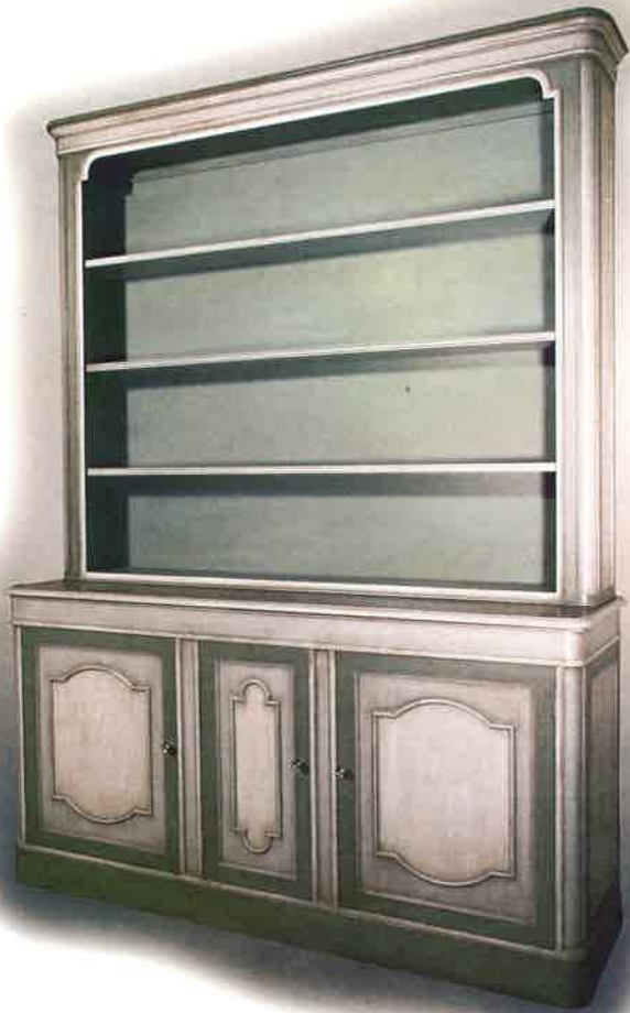
#212 HIGH CABINET 65"W x 18"D x 86"H Illustrated in antique painted finish.