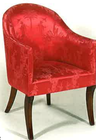
#518 TUB CHAIR 23" W x 23" D x 34½" H Illustrated with mahogany show wood. Requires 3 yds. of 50" plain fabric.