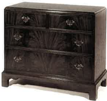
#5060 CHEST OF DRAWERS 39"W X 19"D X 32"H Illustrated in mahogany with crotch mahogany drawer faces.