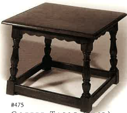
#475 COFFEE TABLE (PAIR) 20"W X 20"D X 16"H Illustrated in oak.