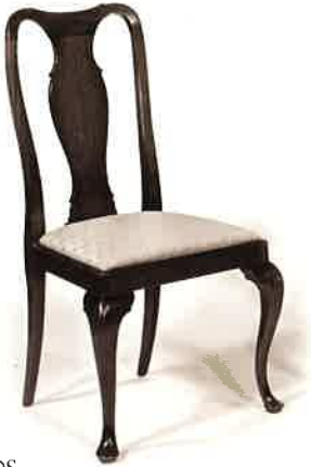
#10S QUEEN ANNE SIDECHAIR 20½" W X 21½" D X 41½" H Illustrated in mahogany with slip seat. Requires ⅔ yd. of 50" fabric for 2 seats.