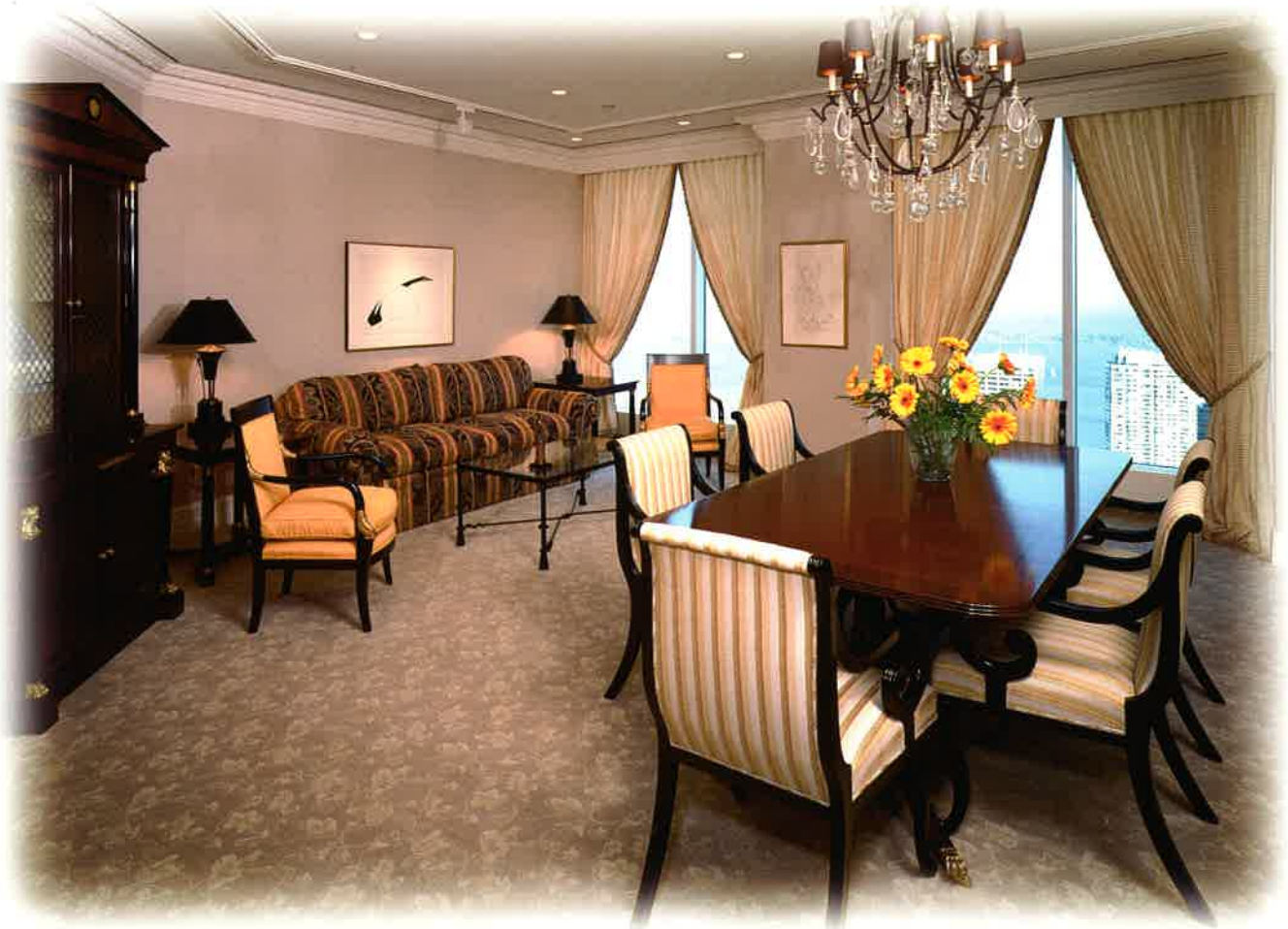
Newcourt Credit Group

Meeting Tables Dining Tables Boardroom Tables