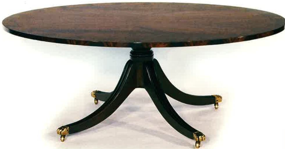
#740 OVAL PEDESTAL COFFEE TABLE 48"W X 34"D X 18"H Illustrated in mahogany with four piece crotch mahogany top and crotch mahogany crossbanding.