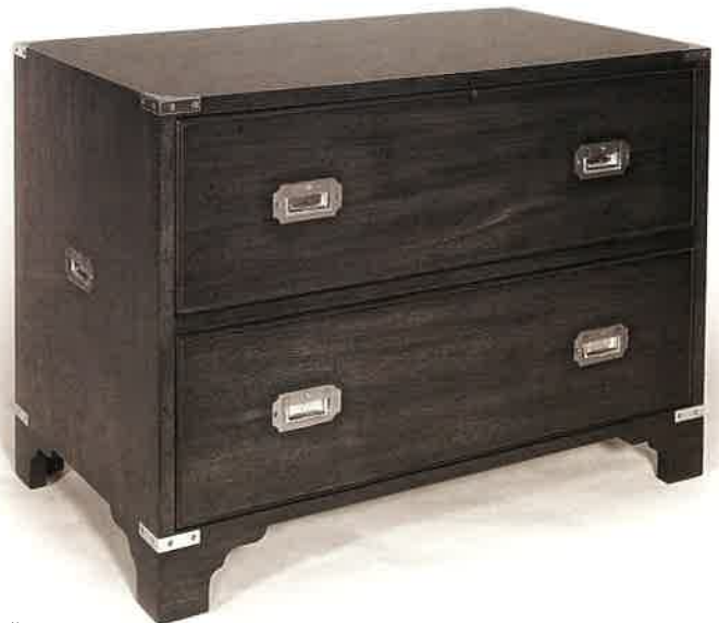
#213 MILITARY CHEST 32"W x 18"D x 23"H Illustrated in mahogany. (For handles see model #223 above)