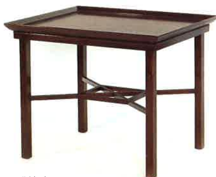
#4252 TEA TABLE 30"W X 24"D X 24"H Illustrated in mahogany with crotch mahogany top.