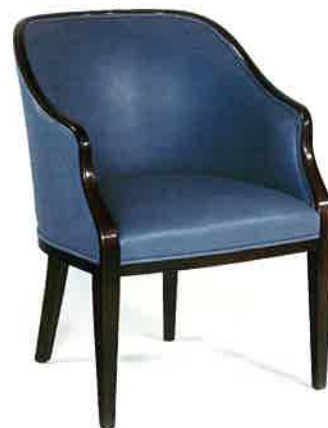
#2026 TUB CHAIR 25" W X 25½" D X 34" H Illustrated in mahogany. Requires 2½ yds. of 50" plain fabric.