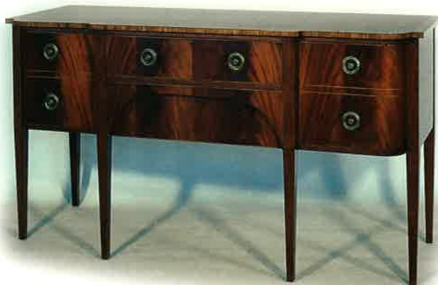
#5058 SIDEBOARD 66"W x 26"D x 36"H Illustrated in mahogany and crotch mahogany faces, one centre drawer with two outer cupboard doors.