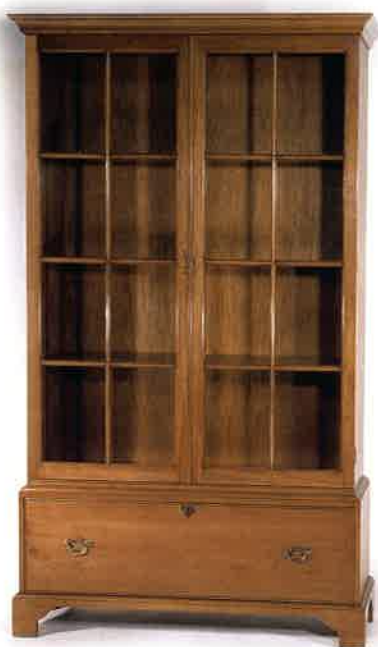
#5044 BOOKCASE 46"W x 16"D x 80"H Illustrated in walnut.