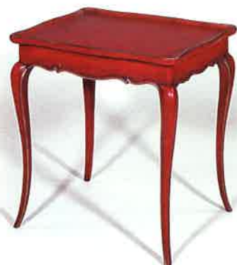
#794 LAMP TABLE 20"W X 25"D X 25"H Illustrated in walnut with painted finish.