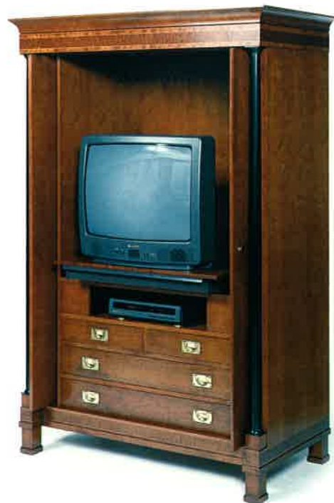
#5018AV BIEDERMEIER AUDIO VISUAL CABINET 48"W X 27"D X 76"H Interior illustrated with pull-out swivel television shelf and storage drawers.