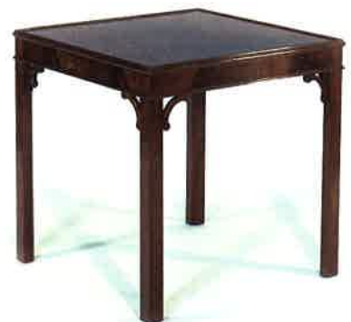
#4205 LAMP TABLE 24"W X 24"D X 23"H Illustrated in mahogany with crotch mahogany top and apron.