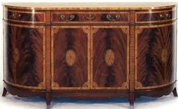
#5061A BOWFRONT SIDEBOARD 60"W X 16"D X 32"H Illustrated in mahogany with crotch mahogany and inlays.