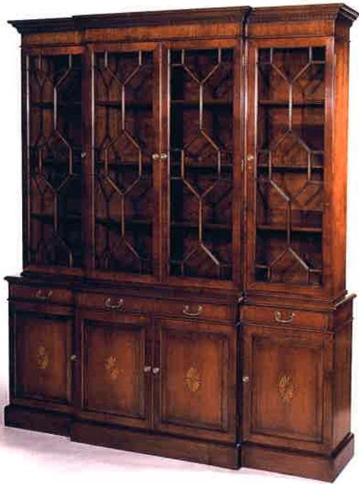
#5096 BREAKFRONT BOOKCASE 72"W x 16"D x 85"H Illustrated in mahogany with panel doors and inlays.