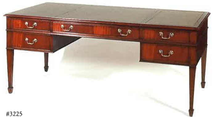
#3225 TABLE DESK 72"W X 36"D X 30½"H Illustrated in mahogany with crotch mahogany drawer fronts and three panel leather top.