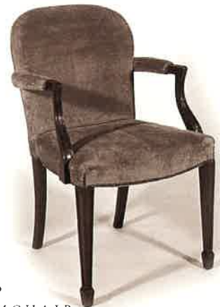
#1956 ARMCHAIR 22 \frac{1}{2} "W X 26"D X 37"H Illustrated with mahogany show wood. Requires 1 \frac{2}{3} yds. of 50" plain fabric.