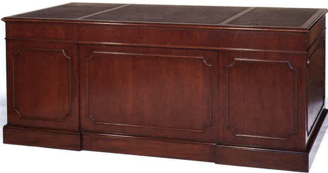
#3100C BREAKFRONT DOUBLE PEDESTAL DESK 72"W x 36"D x 30"H View of visitor's side.