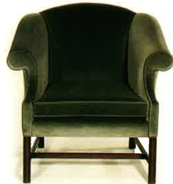
#2550A CHIPPENDALE CLUB CHAIR 29" W x 31" D x 37" H Illustrated with mahogany show wood. Requires 6½ yds. of 50" wide plain fabric. Seat depth 20½".