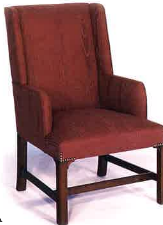
#35A ARMCHAIR 24½" W x 27½" D x 41" H Illustrated in mahogany with closed arm and wings. Requires 4 yds. of 50" plain fabric for the tight seat, or 5¼ yds. for the cushion seat.