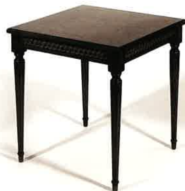
#791 LAMP TABLE 22"W X 22"D X 23"H Illustrated in walnut.