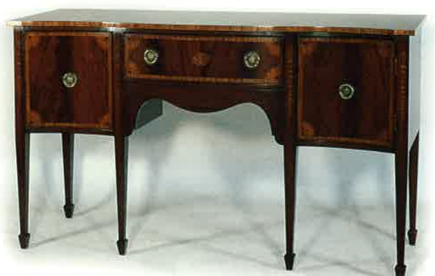
#978A SERPENTINE SIDEBOARD 60"W x 20"D x 35"H Illustrated in mahogany with crotch mahogany door and drawer faces. Also available in 72"W x 20"D x 35"H.