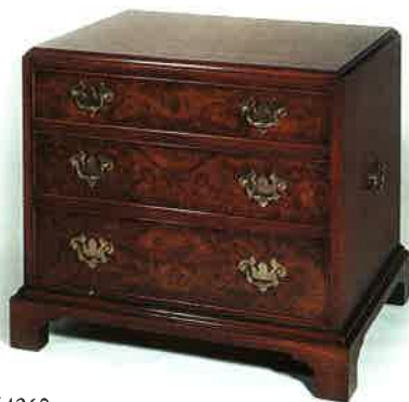
#4260 MINIATURE CHEST 24½"W X 18"D X 22½"H Illustrated in mahogany with burl walnut drawer faces.