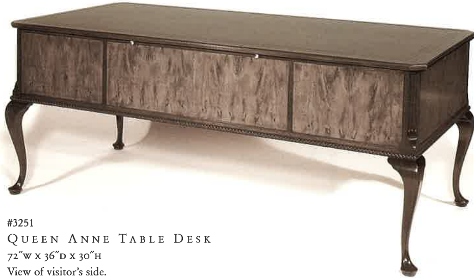
#3251 QUEEN ANNE TABLE DESK 72"W X 36"D X 30"H View of visitor's side.