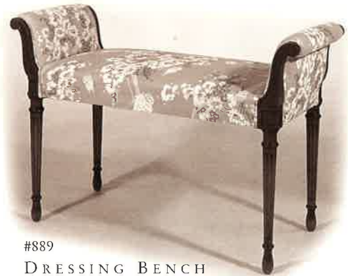
#889 DRESSING BENCH 37"W X 15"D X 25 \frac{1}{2} "H Illustrated in mahogany with hand carving. Requires 1 \frac{1}{3} yds. of 50" plain fabric.