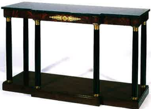
#291 CONSOLE TABLE 54" W X 18" D X 32" H Illustrated in mahogany with crotch mahogany apron and optional marble top.