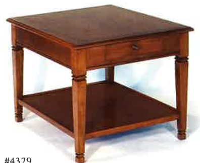
#4329 L A M P T A B L E 30"W x 26"D x 21½"H Illustrated in maple with birds eye maple top with drawer and shelf.