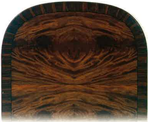
TABLE TOP #3

Radiused corner top shape illustrated with crotch mahogany crossband, inlaid black line and flat cut mahogany.