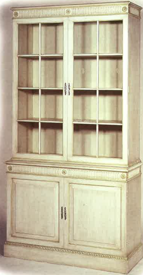
#110 BOOKCASE 43½"W x 18"D x 84"H Illustrated in antique painted finish.