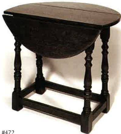
#472 DROP LEAF OCCASIONAL TABLE 26" DIA X 23"H Illustrated in solid oak.