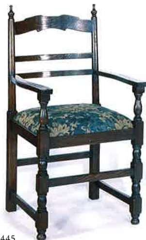
#445 ARMCHAIR 20"W x 18 \frac{1}{2} "D x 38 \frac{1}{2} "H Illustrated in oak with slip seat. Requires \frac{2}{3} yd. of 50" plain fabric.