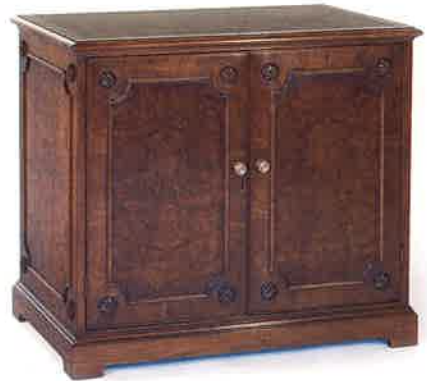
#3150A CABINET 36"W X 18"D X 30"H Illustrated in walnut with burl walnut and hand carved rosettes.