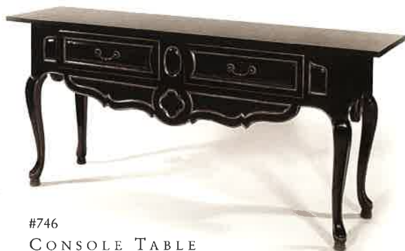
#746 CONSOLE TABLE 72"W X 17"D X 32"H Illustrated in mahogany with gilt trim.