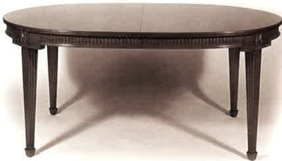
#785 OVAL DINING TABLE 66" L x 44" W x 29" H plus 3 - 18" leaves (leaves not shown) Illustrated in walnut with hand carved swags.