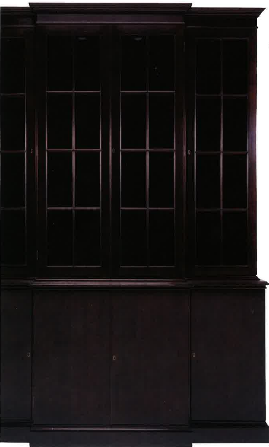
#5080N TRANSITIONAL BREAKFRONT BOOKCASE

Guildhall's breakfront bookcases have become signature pieces over the years, all hallmarks of our cabinetmaker's skills. The cabinet to the right has been reintroduced in a flat cut mahogany without inlays or additional mouldings. The nickel plated escutcheons and our "Dark Empire" stain colour completes a rich transitional appearance. As one of the last manufacturers to offer a true French polish, the finish on this Guildhall cabinet will ensure its place in history.