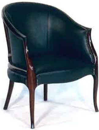
#255 BANK OF ENGLAND TUB CHAIR 25"W X 27"D X 32"H Illustrated in mahogany. Requires 3 yds. of 50" plain fabric.