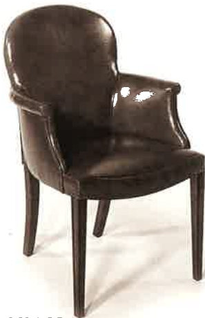
#2155 ARMCHAIR 22"W X 25"D X 37 \frac{1}{2} "H Illustrated with mahogany show wood. Requires 2 \frac{1}{2} yds. of 50" plain fabric.