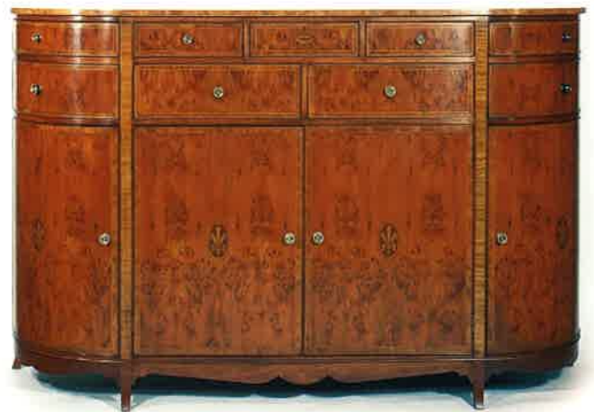
#5061B SIDEBOARD 78"W x 22"D x 50"H Illustrated in yew-wood with inlays and mahogany solids.