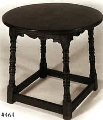
#464 LAMP TABLE 24"DIA X 23½"H Illustrated in oak.