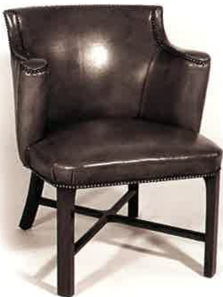
#512 TUB CHAIR 23" W x 23½" D x 31" H Illustrated with mahogany show wood and brass nails. Requires 3 yds. of 50" plain fabric.