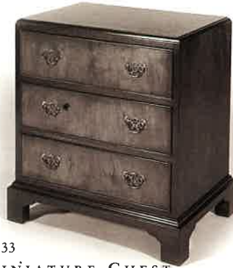
#133 MINIATURE CHEST 22"W X 15"D X 25"H Illustrated with yew-wood drawer faces.