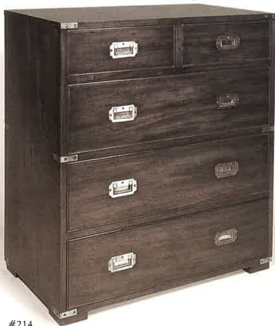
#214 MILITARY CHEST 30"W x 17"D x 33"H Illustrated in mahogany. (For handles see model #223 above)