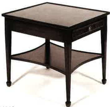
#4320 LAMP TABLE 22" W X 26" D X 23" H Illustrated in mahogany with crotch mahogany drawer face and inlaid border.