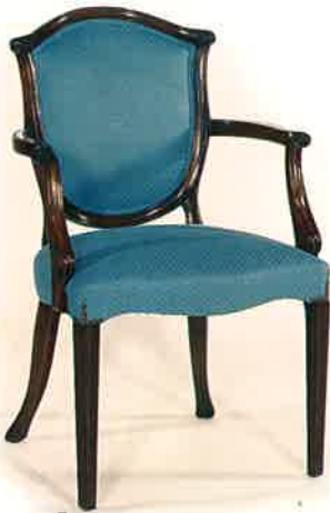
#295U SHIELD BACK ARMCHAIR 22½" W x 19½" D x 37" H Illustrated in mahogany with upholstered back and hand carving. Requires 1⅔ yds. of 50" plain fabric.