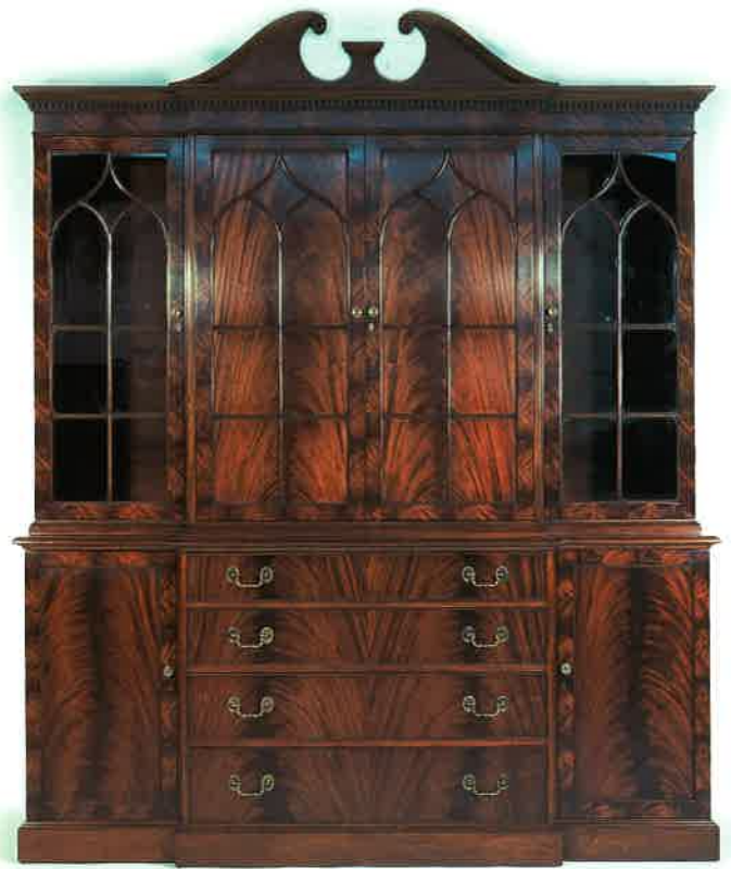
#5010AV AUDIO VISUAL CABINET 84"W x 28"D x 86"H Illustrated in mahogany with crotch mahogany drawer and door faces.