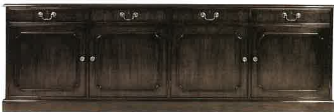
#3130 CREDENZA 90"W x 24"D x 30"H Illustrated in flat cut mahogany with Chippendale mouldings.