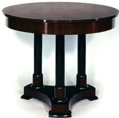
#6008 CENTRE TABLE 36" DIA X 30" H Illustrated in mahogany with crotch mahogany top, rosewood apron and crossband on top.