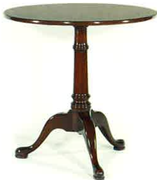
#4355 PEDESTAL TABLE 30"D X 29½"H Illustrated in mahogany.