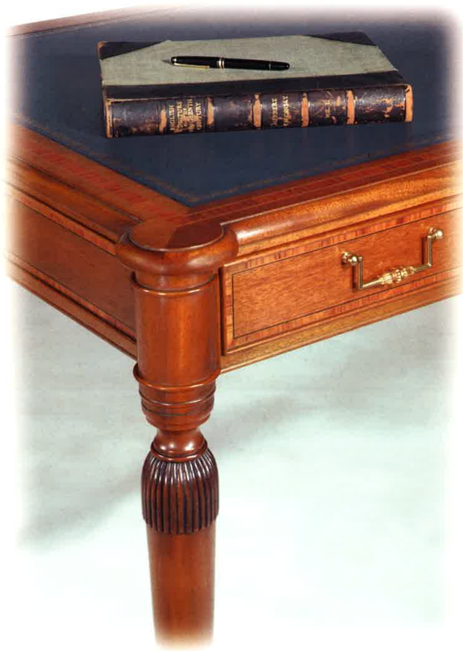
Detail of table desk, design # 3841A - section 5, page 13.