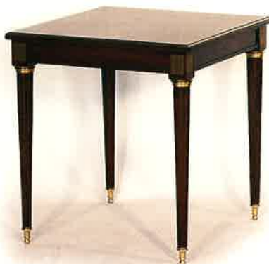
#988 LAMP TABLE 18"W X 26"D X 23"H Illustrated in mahogany with plaque azurée.