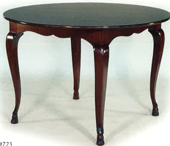
#723 ROUND DINING TABLE 44" DIA X 29"H Illustrated in walnut.