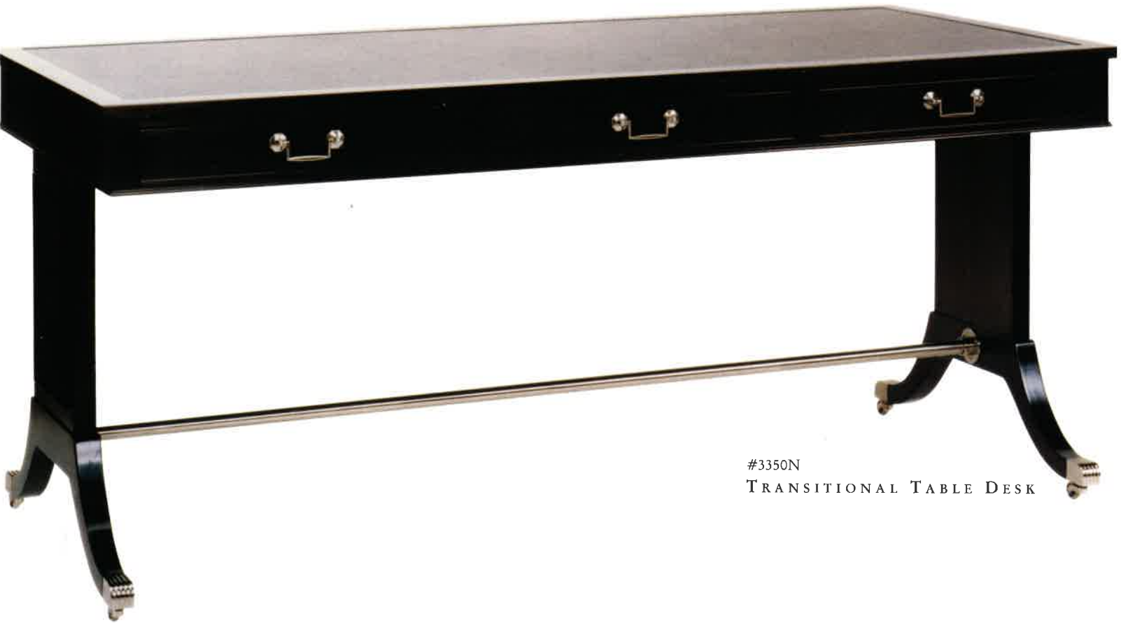
#3350N TRANSITIONAL TABLE DESK