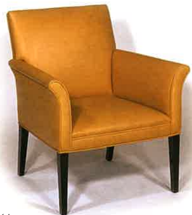
#2064 TRANSITIONAL ARMCHAIR 25½" W x 27" D x 34" H Illustrated with mahogany show wood and scroll arm. Requires 3¼ yds. of 50" plain fabric.