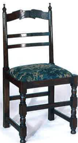
#445 SIDE CHAIR 18 \frac{1}{4} "W x 18 \frac{1}{2} "D x 38 \frac{1}{2} "H Illustrated in oak with slip seat. Requires \frac{2}{3} yd. of 50" plain fabric.