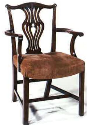
#5 CHIPPENDALE ARMCHAIR 23"W x 23"D x 37 1/2"H Illustrated in mahogany with hand carving. Requires 3/4 yd. of 50" plain fabric.