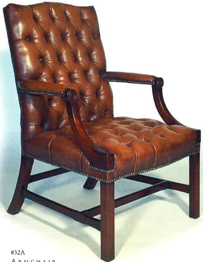
#32A ARMCHAIR 25"W x 21"D x 39"H Illustrated in mahogany with diamond tufted leather. Requires 2 1/2 yds. of 50" plain fabric.