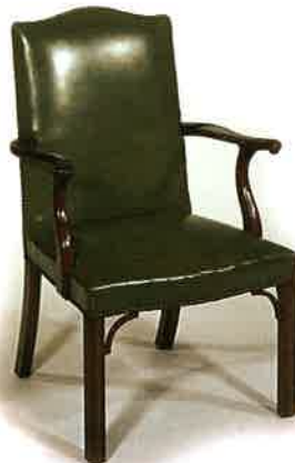
#2045 ARMCHAIR 23½" W X 23½" D X 40" H Illustrated in mahogany with upholstered arm. Requires 1¾ yds. of 50" plain fabric.