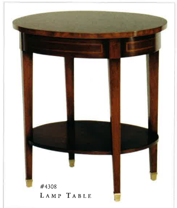
#4308 LAMP TABLE

The Lamp Table to the left reinterprets our traditional classic with an updated look. The elegant traditional lines, the mahogany and hand applied French polish all remain. The design is simplified to the bare essentials with the mahogany stained in our "Dark Empire" and the solid brass feet are nickel plated.