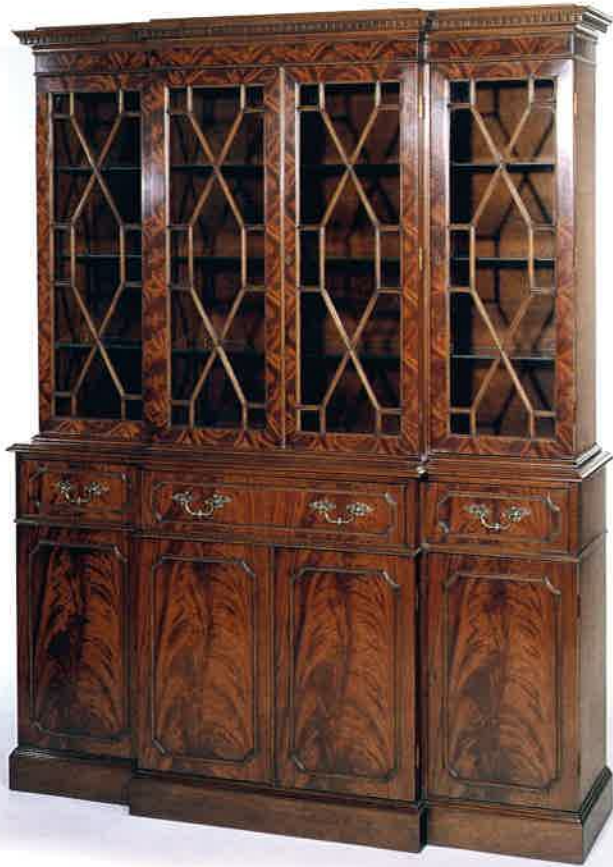
#415 BREAKFRONT BOOKCASE 59"W X 17"D X 76½"H Illustrated in mahogany and crotch mahogany.