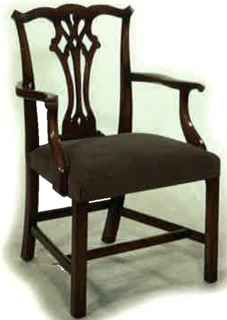
#4 CHIPPENDALE ARMCHAIR 24" W x 23" D x 38" H Illustrated in mahogany. Requires ¾ yd. of 50" plain fabric.