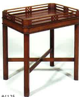
#4125 LAMP TABLE 18"W X 24"D X 26"H Illustrated in mahogany with crotch mahogany top.