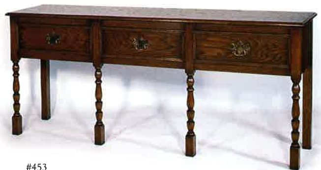
#453 CONSOLE TABLE WITH THREE DRAWERS 72"W x 18"D x 31"H Illustrated in oak.