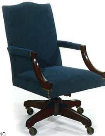
#2840 SWIVEL CHAIR 25" W x 27½" D x 42" H Illustrated in mahogany with upholstered arm. Requires 2½ yds. of 50" plain fabric.