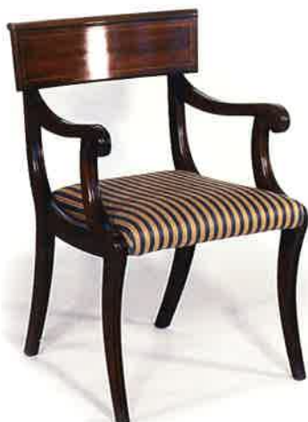
#2008 ARMCHAIR 22" W X 22½" D X 33¾" H Illustrated in mahogany with boxwood line. Requires ¾ yd. of 50" plain fabric.