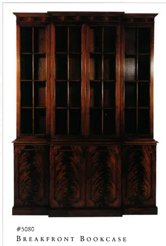
#5080 BREAKFRONT BOOKCASE

The cabinet below is one of our original bookcases, handmade in the Chippendale style. Crotch mahogany on the door faces and frieze are accentuated by the Chippendale door mouldings. A simple, individual glass pane design adds to the original timeless elegance of the bookcase.