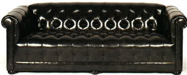
#2520 SOFA 82" W x 36½" D x 29" H Illustrated with diamond tufted upholstery. Requires 16 yds. of 50" wide plain fabric. Seat depth 23".