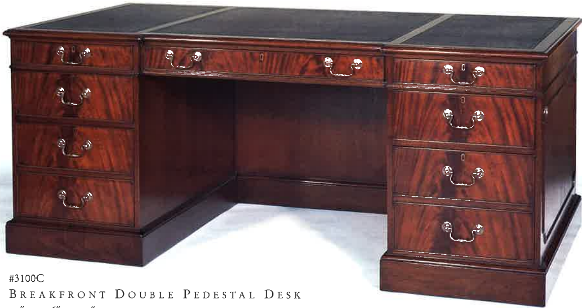
#3100C BREAKFRONT DOUBLE PEDESTAL DESK 72"W x 36"D x 30"H Illustrated in mahogany with crotch mahogany drawer fronts, three panel leather top and applied Chippendale mouldings all around.