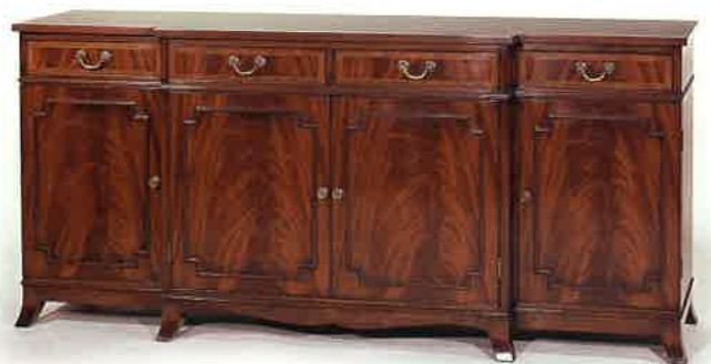
#317 BREAKFRONT SIDEBOARD 72" W x 17" D x 33" H Illustrated in mahogany and crotch mahogany door and drawer faces with Chippendale mouldings.