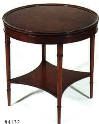
#4132 LAMP TABLE 24" DIA X 23"H Illustrated in mahogany.