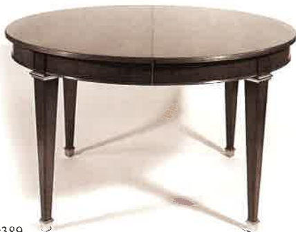
#389 DINING TABLE 50" DIA x 29" H plus 3 - 18" leaves (leaves not shown) Illustrated in mahogany with brass collars and feet.