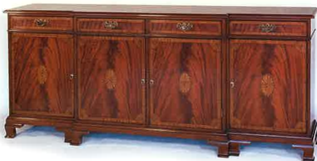
#198A BREAKFRONT SIDEBOARD 72" W x 17" D x 33" H Illustrated in mahogany and crotch mahogany drawer and door faces with inlays.