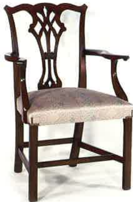
#16 CHIPPENDALE ARMCHAIR 22 1/2"W x 21"D x 37 1/2"H Illustrated in mahogany. Requires 3/4 yd. of 50" plain fabric.