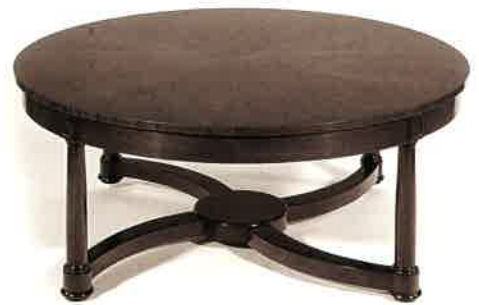
#4134 COFFEE TABLE 48"DIA X 19"H Illustrated in mahogany with starburst top and rosewood crossbanding.