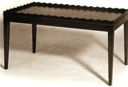
#961 COFFEE TABLE 32"W X 18"D X 16"H Illustrated in mahogany.