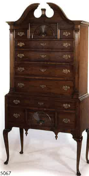
#5067 QUEEN ANNE HIGH BOY 40 \frac{3}{4} "W x 19 \frac{1}{2} "D x 83"H Illustrated in mahogany.