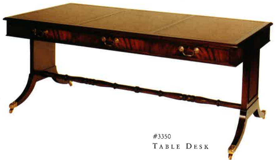
#3350 TABLE DESK

To the right is the original Table Desk which is found in our catalogue with almost 500 additional traditional designs. The desk is made of mahogany with crotch mahogany drawer faces and a three piece leather top with 24 carat gold tooling. The period hardware is antiqued solid brass. The wood finish is a true French polish, hand applied over a two week period.