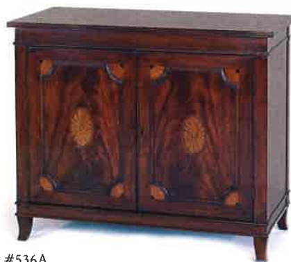
#536A CABINET 36"W X 18"D X 30"H Illustrated in mahogany and crotch mahogany inlaid doors.