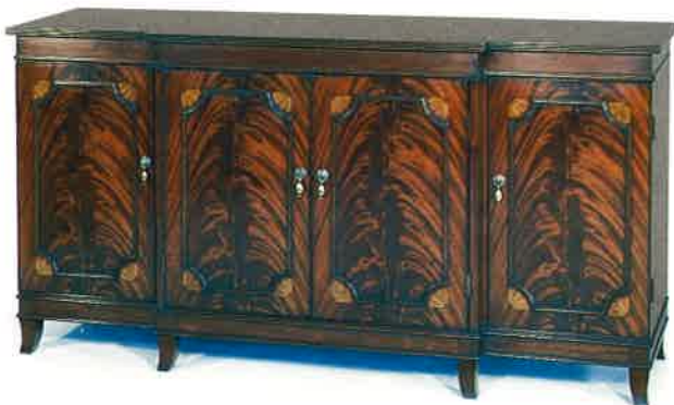
#536 BREAKFRONT SIDEBOARD 60"W X 18"D X 31"H Illustrated in mahogany and crotch mahogany with fan inlays.