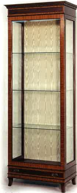
#5074 DISPLAY CABINET 26"W x 15"D x 78"H Illustrated in mahogany and satinwood.