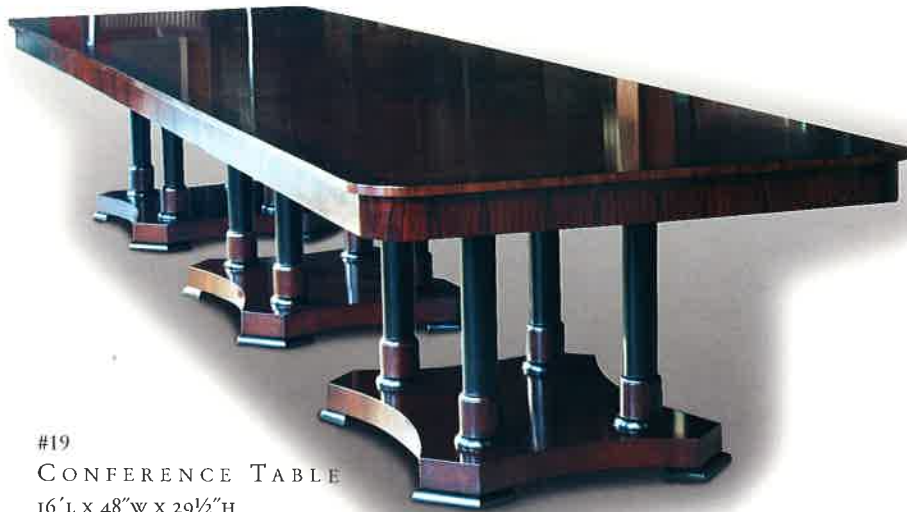
#19 CONFERENCE TABLE 16' L x 48" W x 29½" H Illustrated in mahogany with rosewood apron and crossbanding plus black line on top. Top size is 72" wide maximum.