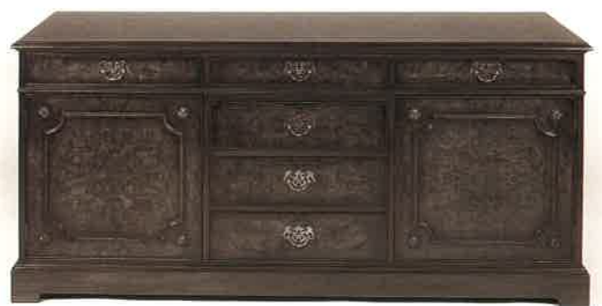
#3150 CREDENZA 66"W X 20"D X 30"H Illustrated in walnut with burl walnut drawer and door faces with Chippendale mouldings and hand carved rosettes.