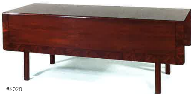
#6020 DROP LEAF CONFERENCE OR DINING TABLE 78" L x 60" W x 29 1/2" H (open size) Illustrated in mahogany with crotch mahogany crossbanding and inlaid ebony line. Table comes with two 16" wide leaves. Leaves can have rounded shape to create oval shape when open. Closed size is 28" wide.