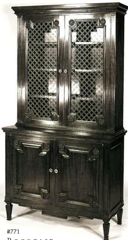
#771 BOOKCASE 41 \frac{1}{2} "W x 18"D x 78"H Illustrated in walnut with hand carved rosettes and double weave grillage.