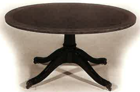
#187 PEDESTAL COFFEE TABLE 36"W X 26"D X 18"H Illustrated in mahogany with four piece crotch mahogany top and yew-wood crossbanding.