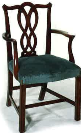
#1 CHIPPENDALE ARMCHAIR 22" W x 22¾" D x 37½" H Illustrated in mahogany. Requires ¾ yd. of 50" plain fabric.