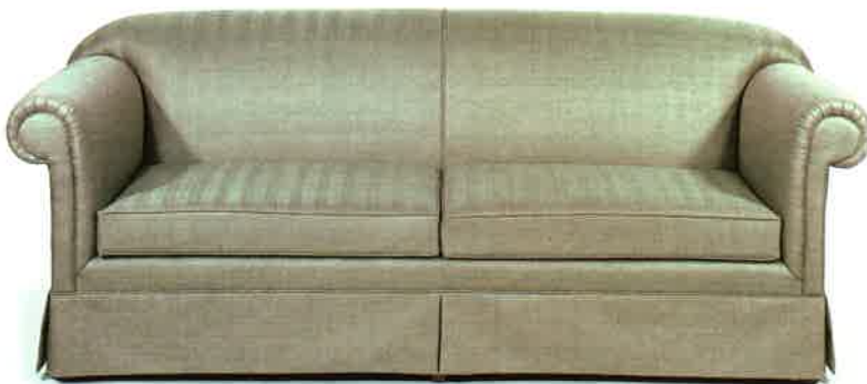
#2560 TWO SEATER SOFA 83½" W x 34¾" D x 33¼" H Requires 14 yds. of 50" wide plain fabric. Seat depth 22".