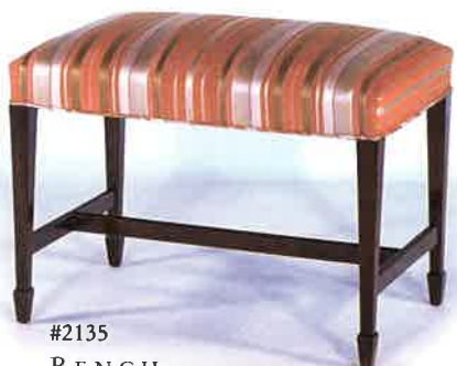
#2135 BENCH 26"W x 16"D x 18"H Illustrated in mahogany, with fully upholstered top. Requires 1 yd. of 50" plain fabric.