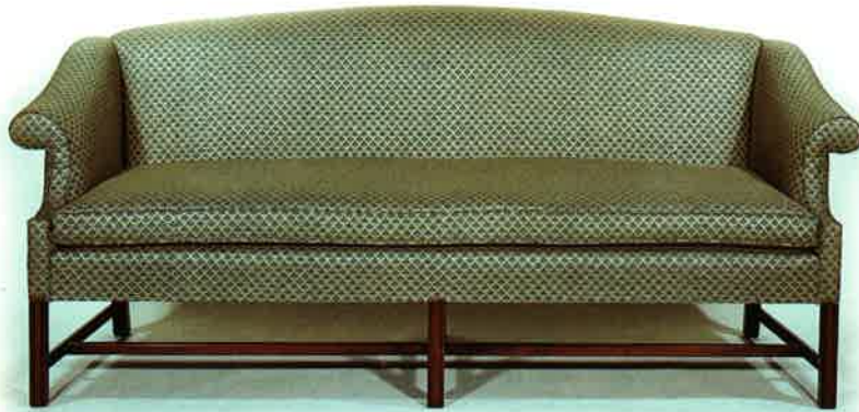
#2550 CHIPPENDALE SOFA 87" W x 31" D x 36½" H Illustrated with mahogany show wood. Requires 12 yds. of 50" wide fabric. Seat depth 21".