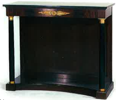
#304 CONSOLE TABLE 49" W X 17" D X 36" H Illustrated in mahogany with optional marble top.