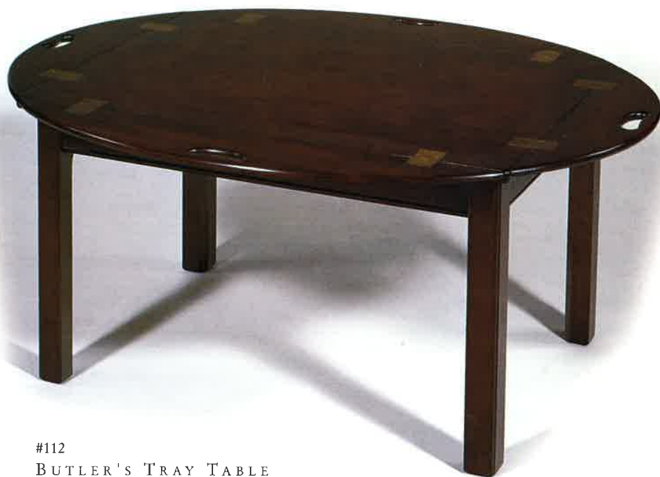
#112 BUTLER'S TRAY TABLE 40"W X 31"D X 17½"H (30½"W X 21½"D with top folded up) Illustrated in mahogany.