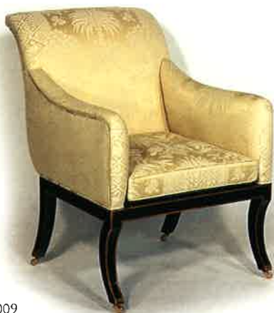
#2009 CASTLE HOWARD CHAIR 27" W x 31½" D x 36½" H Illustrated with ebonized finish and gilt trim. Requires 4½ yds. of 50" plain fabric.