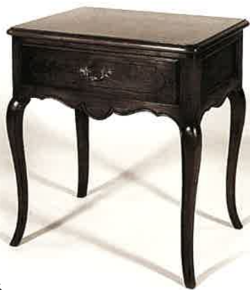
#406 OCCASIONAL TABLE 24"W X 18"D X 26"H Illustrated in walnut.