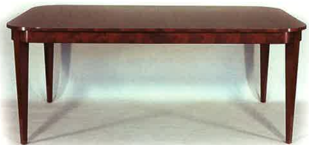
#517 DINING TABLE 66" L x 44" W x 29 1/2" H Illustrated in mahogany with crotch mahogany crossbanding.