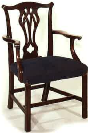
#3 CHIPPENDALE ARMCHAIR 23¾" W x 21½" D x 38¼" H Illustrated in mahogany. Requires ¾ yd. of 50" plain fabric.