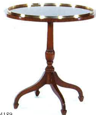
#4189 PEDESTAL TABLE 23"DIA X 25"H Illustrated in mahogany with insert raised brass gallery.