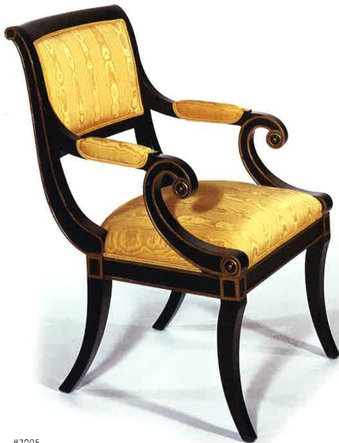
#2005 REGENCY ARMCHAIR 22¼" W X 26¾" D X 35½" H Illustrated in ebonized finish with gilt trim. Requires 1½ yds. of 50" plain fabric.