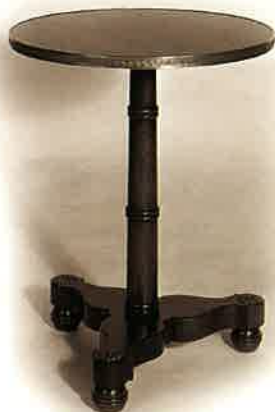
#208 OCCASIONAL TABLE 18"DIA X 24"H Illustrated in mahogany with lip brass edge.