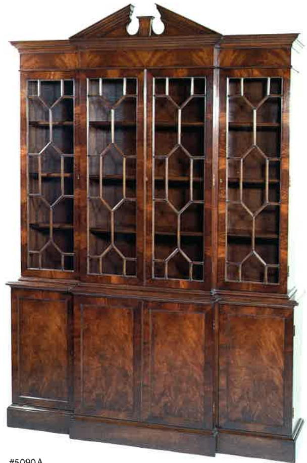
#5090A BREAKFRONT BOOKCASE 60"W X 15"D X 84"H Illustrated in mahogany with crotch mahogany door panels frames and frieze.