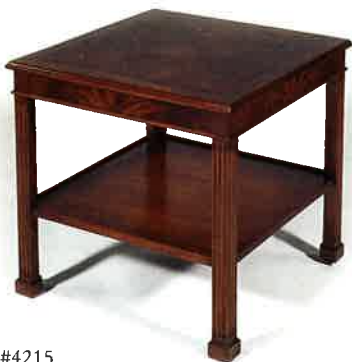
#4215 LAMP TABLE 25"W X 25"D X 24"H Illustrated in mahogany with crotch mahogany top and apron.