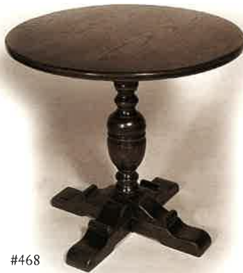
#468 PEDESTAL TABLE 24"DIA X 21½"H Illustrated in oak.