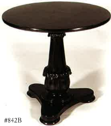
#842B LAMP TABLE 26" DIA X 23"H Illustrated in walnut with hand carved base.