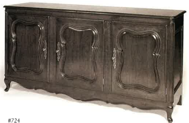
#724 SIDEBOARD 68"W x 19"D x 34"H Illustrated in walnut. Also available in 46" width.