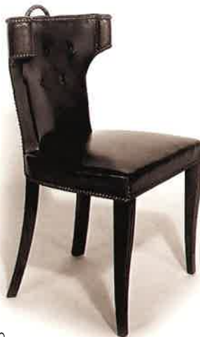
#7700 COCKFIGHTING CHAIR 21½" W x 18" D x 34" H Illustrated in mahogany. Requires 1¾ yds. of 50" plain fabric.