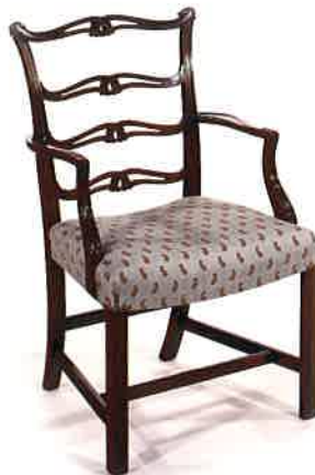
#13 LADDER BACK CHIPPENDALE ARMCHAIR 23"W x 22 1/4"D x 38"H Illustrated in mahogany. Requires 3/4 yd. of 50" plain fabric.