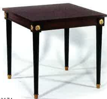
#174 LAMP TABLE 22"W X 22"D X 23"H Illustrated in mahogany with rosewood crossbanded top and ebony legs.