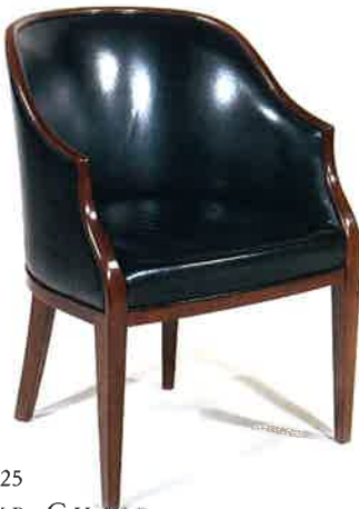
#2025 TUB CHAIR 25"W X 24½"D X 34"H Illustrated in mahogany. Requires 2½ yds. of 50" plain fabric.