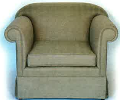
#2560A CLUB CHAIR 41" W x 34¾" D x 33¼" H Requires 9 yds. of 50" wide plain fabric. Seat depth 22".