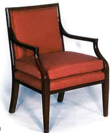
#2000 TRANSITIONAL ARMCHAIR 25" W x 24½" D x 36" H Illustrated in mahogany with cushion seat. Requires 2 yds. of 50" plain fabric for a tight seat and 3 yds. for the cushion seat.