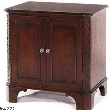
#4271 CHIPPENDALE MINIATURE CHEST 27"W X 18"D X 27"H Illustrated in flat cut mahogany with carved fret work on chamfered corners.