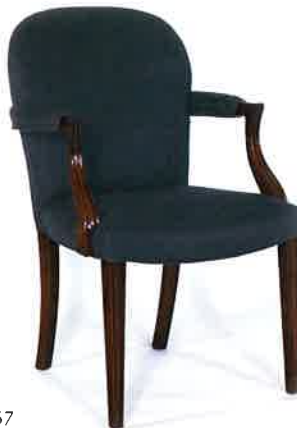
#1957 ARMCHAIR 22 \frac{1}{2} "W X 26"D X 37"H Illustrated with mahogany show wood. Requires 1 \frac{2}{3} yds. of 50" plain fabric.