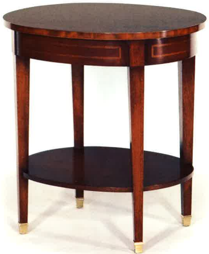
#4308 L A M P T A B L E 23½"W x 18½"D x 24"H Illustrated in mahogany with shelf and inlaid apron.