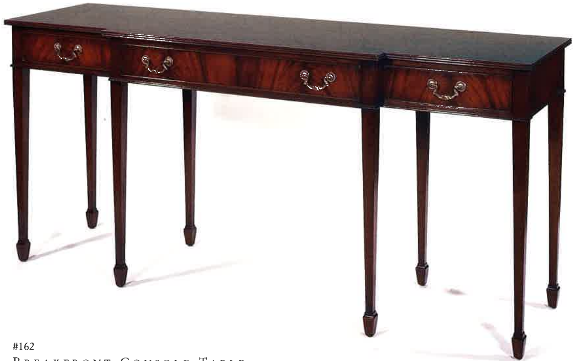
#162 BREAKFRONT CONSOLE TABLE 72"W x 20"D x 33"H Illustrated in mahogany with crotch mahogany drawer faces.