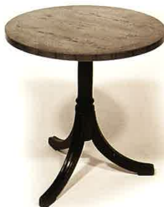
#132 PEDESTAL TABLE 18"DIA X 18"H Illustrated in mahogany with yew-wood top.