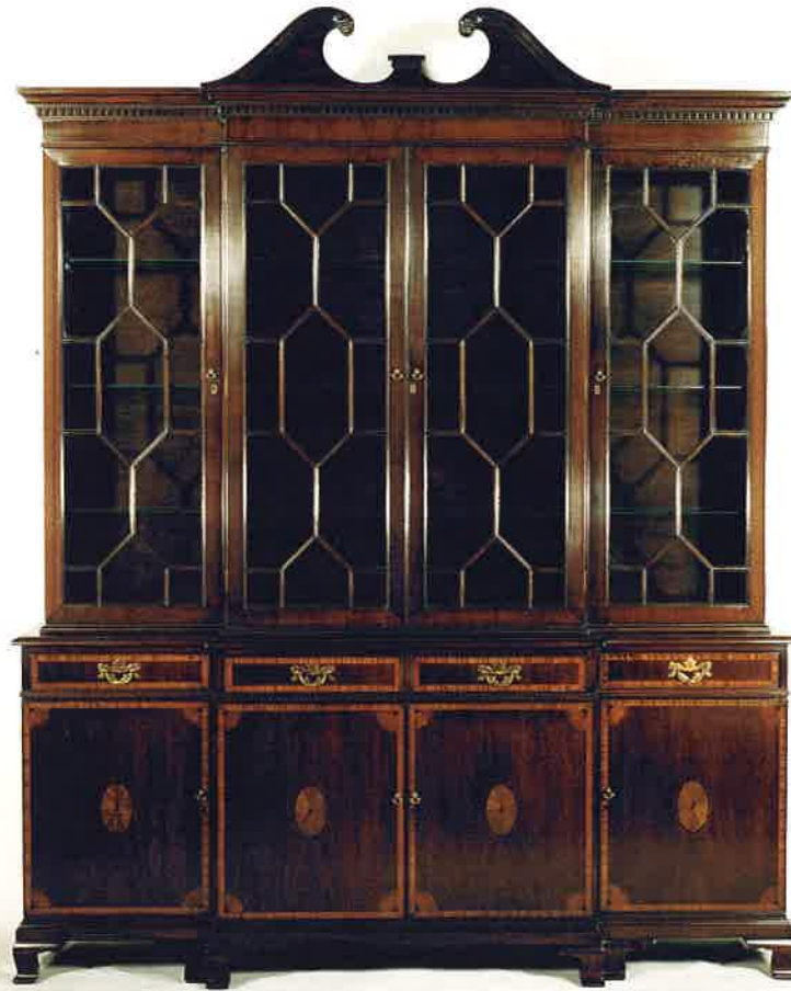
#5093 BREAKFRONT BOOKCASE 72"W x 17"D x 88"H Illustrated in mahogany with inlaid drawers and doors, with pediment.