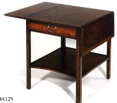
#4129 DROP LEAF OCCASIONAL TABLE 41" W X 27" D X 26" H (21 3/4" D with flaps down) Illustrated in mahogany with yew-wood drawer face.