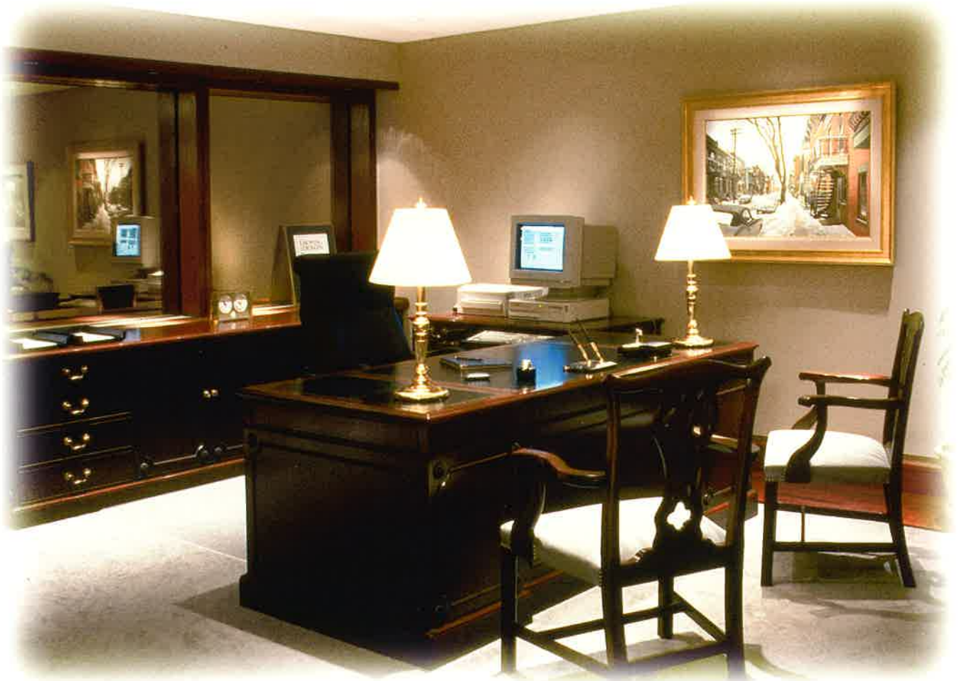
Manulife Financial Head Office

Table Desks Credenza, Telephone Tables Executive Desks Reception Desks