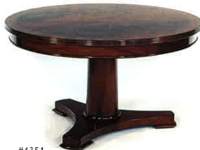
#4351 PEDESTAL COFFEE TABLE 36"DIA X 20"H Illustrated in mahogany with apron. Four piece crotch mahogany top and yew-wood crossbanded border.