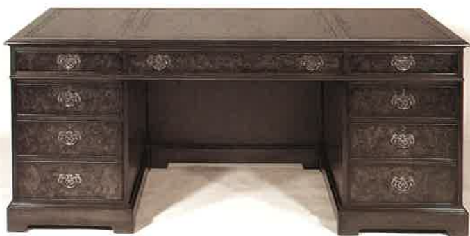
#3175 DOUBLE PEDESTAL DESK 60"W X 30"D X 30"H Illustrated in walnut with burl walnut all around with Chippendale mouldings and hand carved rosettes.