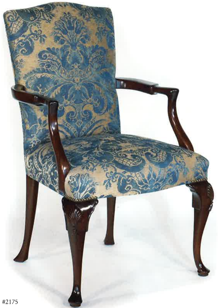
#2175 ARMCHAIR 25" W X 26" D X 40" H Illustrated in mahogany with hand carving on the front legs. Requires 1¾ yds. of 50" plain fabric.