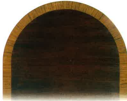
TABLE TOP #4

Modified "D" end illustrated with rosewood crossbanding, inlaid black line and crotch mahogany.