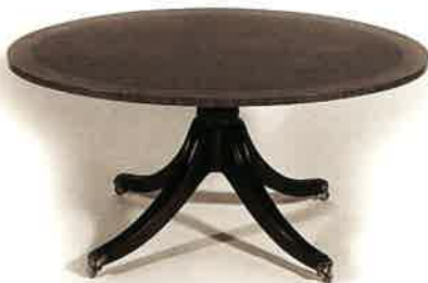
#179 PEDESTAL COFFEE TABLE 39"W X 32"D X 18"H Illustrated in mahogany with yew-wood crossbanding.