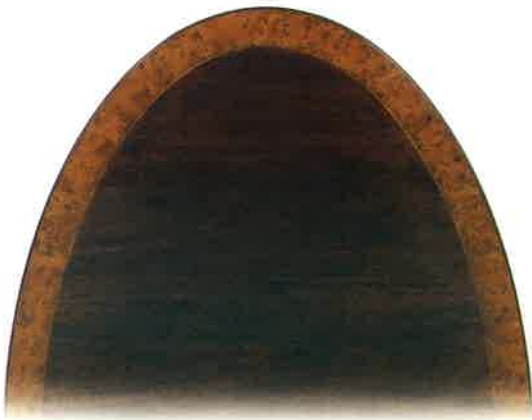
TABLE TOP #1

TWO PEDESTAL DINING TABLE WITH #14 PEDESTAL 76" L x 44" W x 29½" H plus 2 - 22" leaves (leaves not shown) Illustrated in mahogany with flat cut mahogany top and yew-wood crossbanding.