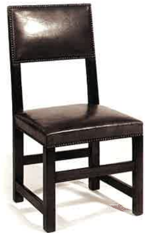
#270 SIDE CHAIR 19" W x 19" D x 35½" H Illustrated in mahogany with brass nails. Requires 1 yd. of 50" plain fabric.