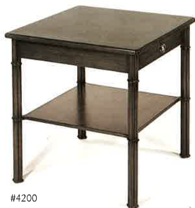
#4200 LAMP TABLE 24"W X 24"D X 25"H Illustrated in mahogany.