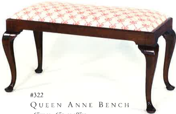
#322 QUEEN ANNE BENCH 36"W X 16"D X 18"H Illustrated in mahogany with slip seat. Requires \frac{2}{3} yd. of 50" plain fabric.