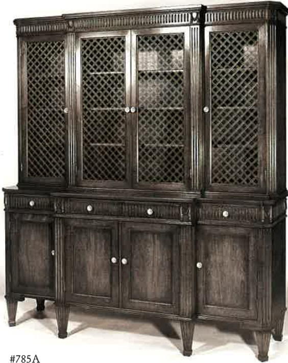
#785A BREAKFRONT BOOKCASE 70"W x 20 \frac{3}{4} "D x 78"H Illustrated in walnut with handcarved swags and double weave grillage.