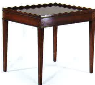
#4151 LAMP TABLE 28"W X 24"D X 26"H Illustrated in mahogany with four piece book matched crotch mahogany top and scalloped gallery top.