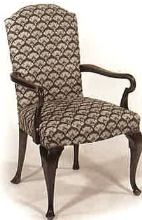
#2171 ARMCHAIR 25" W X 26¾" D X 42" H Illustrated in mahogany with hand carving. Requires 2¼ yds. of 50" plain fabric.