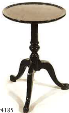
#4185 PEDESTAL TABLE 16"DIA X 22"H Illustrated in mahogany.