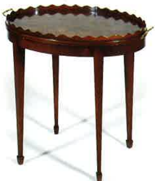
#4305 OCCASIONAL TABLE 24"W X 17½"D X 22"H Illustrated in mahogany with crotch mahogany top.