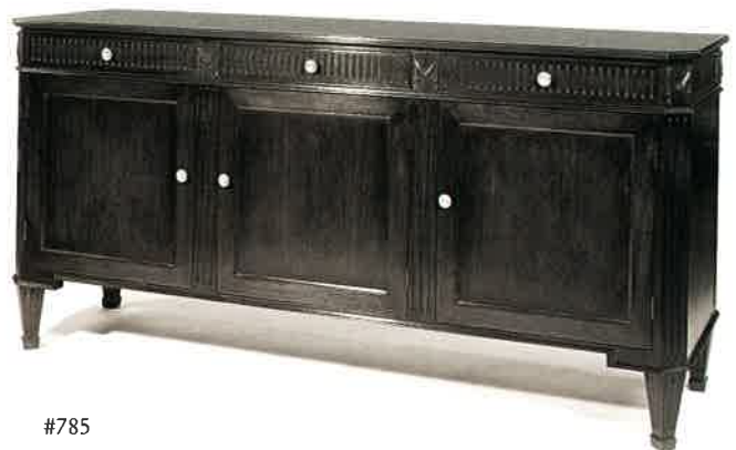
#785 SIDEBOARD 72"W X 21"D X 35"H Illustrated in walnut with hand carved swags.