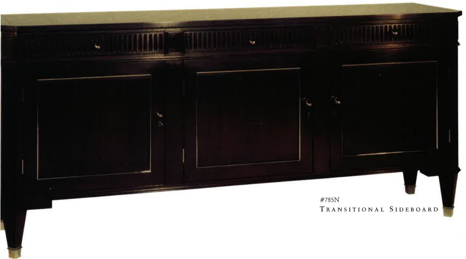
#785N TRANSITIONAL SIDEBOARD