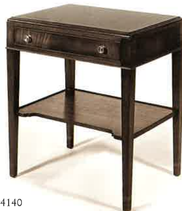
#4140 LAMP TABLE 23"W X 17"D X 26"H Illustrated in mahogany with crotch mahogany drawer face.