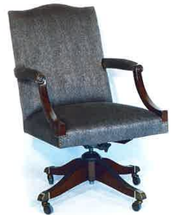
#2800 SWIVEL CHAIR 25" W x 21" D x 41" H Illustrated in mahogany. Supplied with a five-prong base. Requires 2½ yds. of 50" plain fabric.