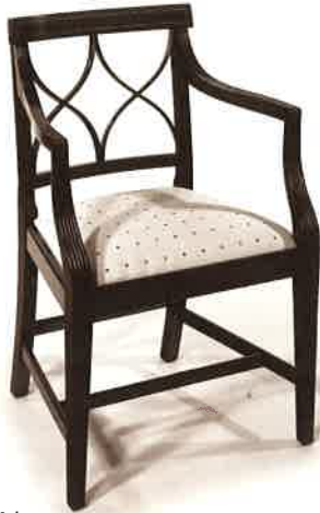
#1282A HOURGLASS BACK ARMCHAIR 22 \frac{3}{4} "W X 21"D X 35 \frac{1}{2} "H Illustrated in mahogany with inlaid border. Requires \frac{2}{3} yd. of 50" plain fabric for 2 seats.