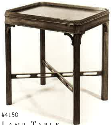
#4150 LAMP TABLE 18½"W X 24"D X 26"H Illustrated in mahogany.