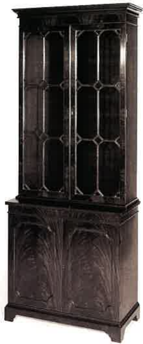
#5085 BOOKCASE 32"W x 16"D x 82"H Illustrated in mahogany with crotch mahogany, crossbanding on frieze and upper doors, crotch mahogany faces on base.