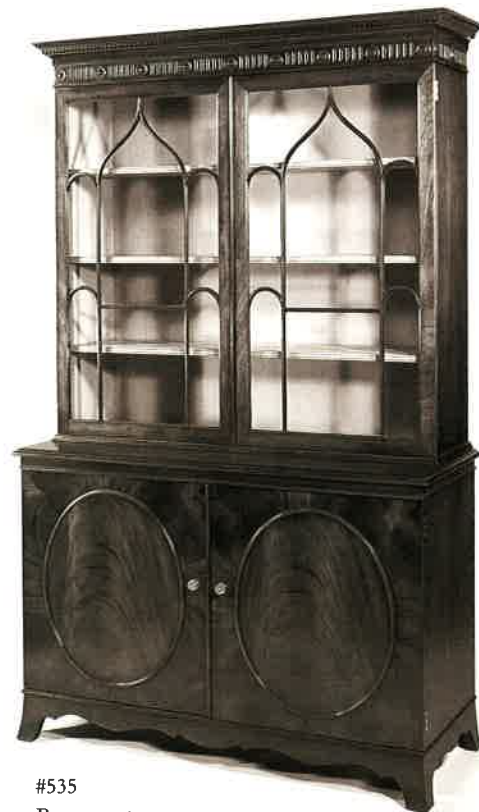
#535 BOOKCASE 50 \frac{1}{2} "W x 18 \frac{1}{2} "D x 78 \frac{3}{4} "H Illustrated in mahogany and crotch mahogany door faces.