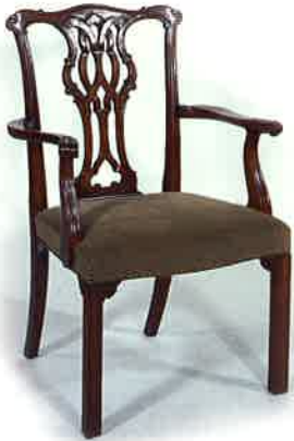
#7 CHIPPENDALE ARMCHAIR 24"W x 23 3/4"D x 39 1/2"H Illustrated in mahogany with hand carving. Requires 3/4 yd. of 50" plain fabric.