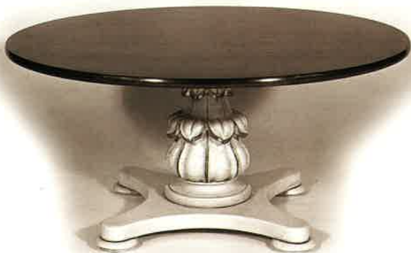
#842A LOTUS BASE COFFEE TABLE 36" DIA X 18"H Illustrated with hand carved painted base and wood top.