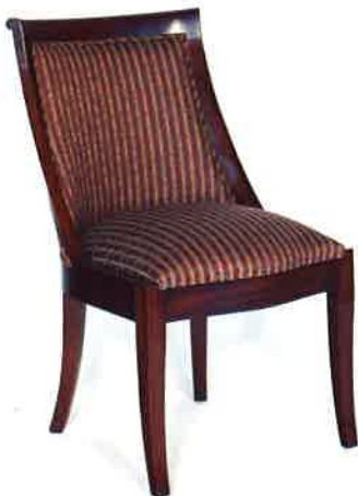
#2195S EMPIRE SIDE CHAIR 22"W X 26¾"D X 35¾"H Illustrated in mahogany. Requires 2 yds. of 50" plain fabric.