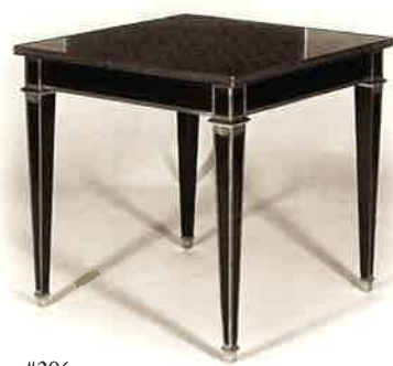
#296 LAMP TABLE 24"W X 24"D X 23"H Illustrated in mahogany with ebony finish, gold accents and brasses.