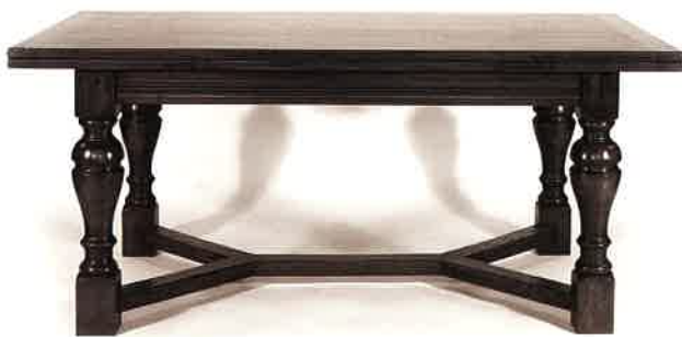
#473A DINING TABLE 66"L X 36"W X 29"H Illustrated in oak with 18" draw leaf at each end.