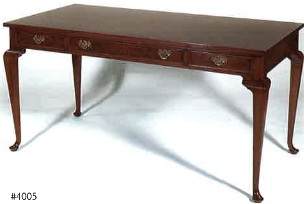
#4005 QUEEN ANNE TABLE DESK 60"W X 30"D X 26½"H Illustrated in walnut with burl walnut drawer faces.