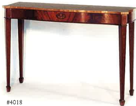
#4018 SERPENTINE CONSOLE TABLE 48"W x 16"D x 32"H Illustrated with crotch mahogany on apron with inlays.