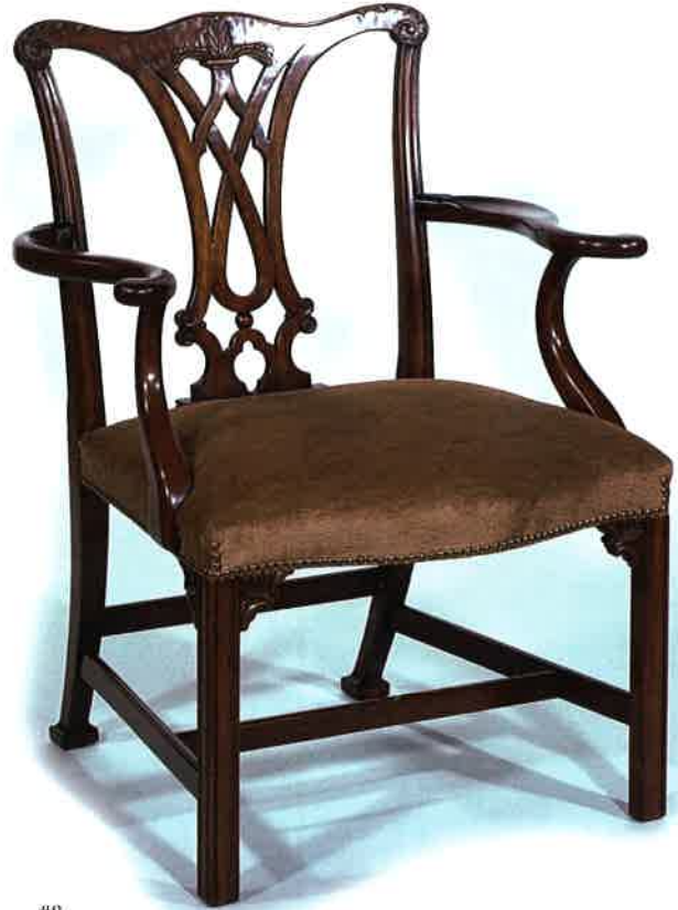
#8 CHIPPENDALE ARMCHAIR 24" W x 25½" D x 37½" H Illustrated in mahogany with hand carving. Requires ¾ yd. of 50" plain fabric.