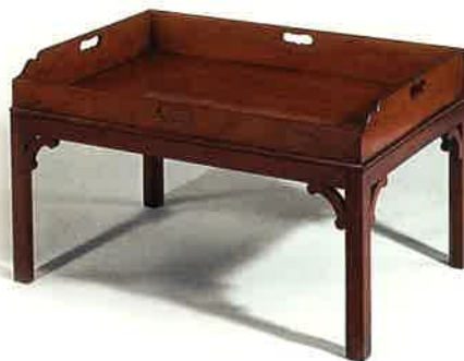
#4211 COFFEE TABLE 36" W X 22" D X 21" H (17" H to top of tray) Illustrated in mahogany.