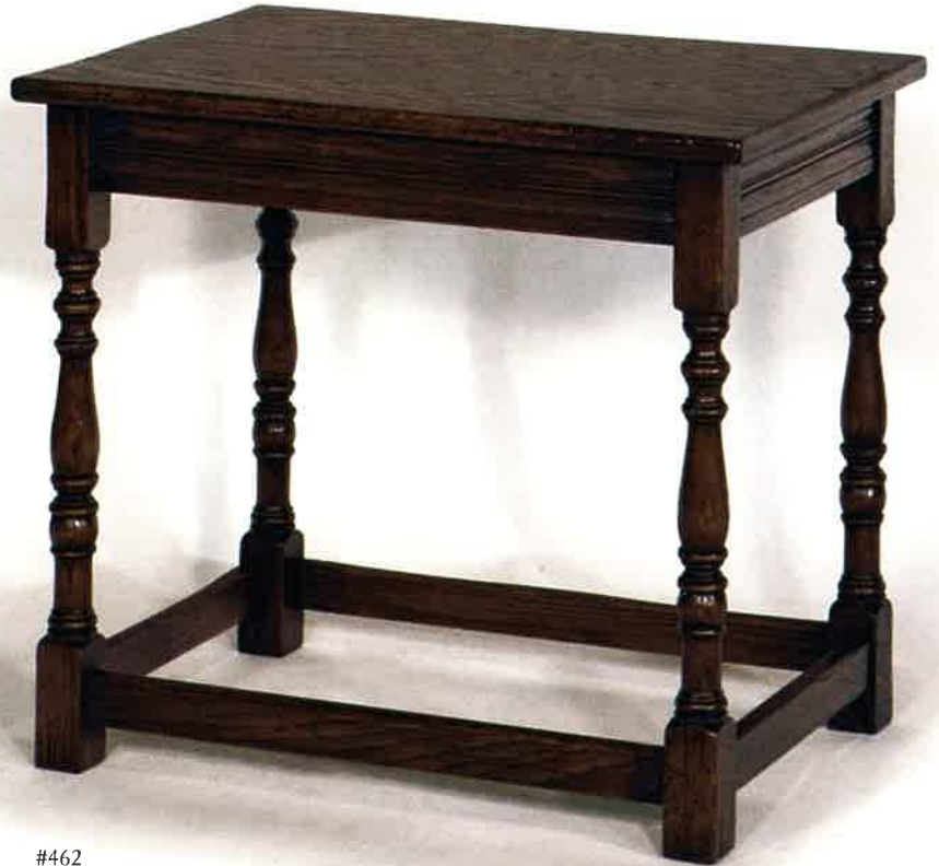
#462 LAMP TABLE 24"W X 17½"D X 22¼"H Illustrated in solid oak.