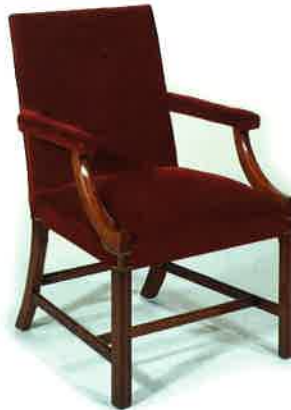
#2030 ARMCHAIR 25" W X 27½" D X 40" H Illustrated in mahogany with upholstered arm. Requires 1¾ yds. of 50" plain fabric.