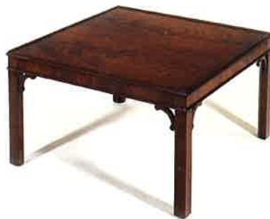
#4210 COFFEE TABLE 30"W X 30"D X 17"H Illustrated in mahogany with crotch mahogany apron and four piece crotch mahogany top.