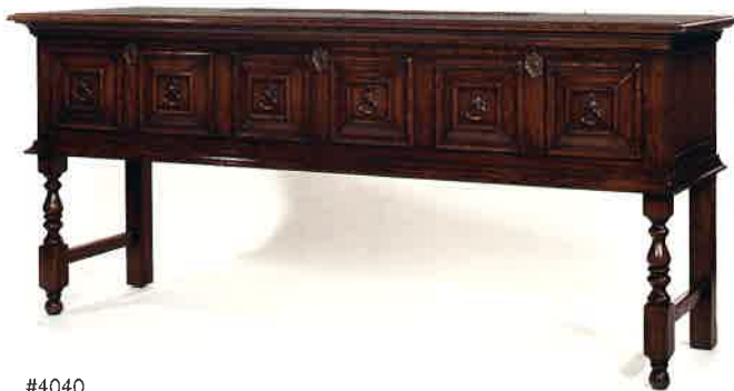
#4040 SIDEBOARD 74"W x 19"D x 32"H Illustrated in oak.