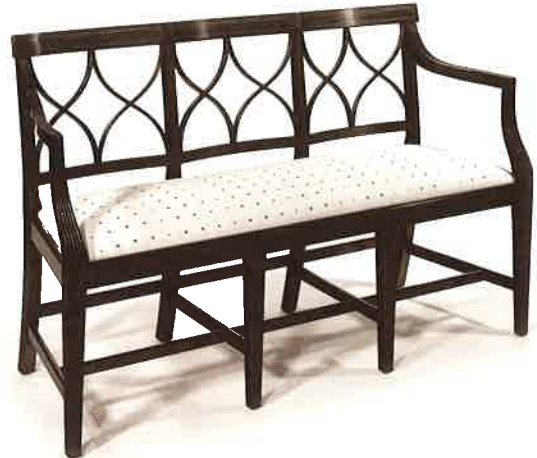
#1282 HOURGLASS BACK SETTEE 54 \frac{1}{2} "W X 21"D X 35 \frac{1}{2} "H Illustrated in mahogany with inlays and hand carving. Requires \frac{2}{3} yd. of 50" plain fabric.