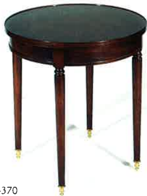
#4370 ROUND LAMP TABLE 24" DIA X 26"H Illustrated in mahogany.