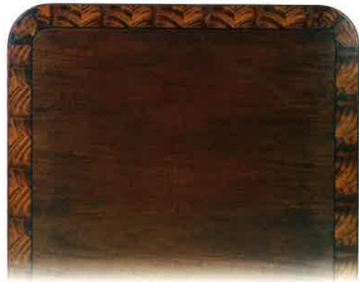
TABLE TOP #2

Oval top shape illustrated with yew-wood crossbanding, inlaid boxwood line and flat cut mahogany.