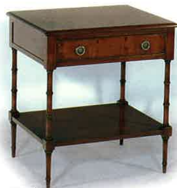
#285A OCCASIONAL TABLE 24"W X 18"D X 23"H Illustrated in mahogany and yew-wood.