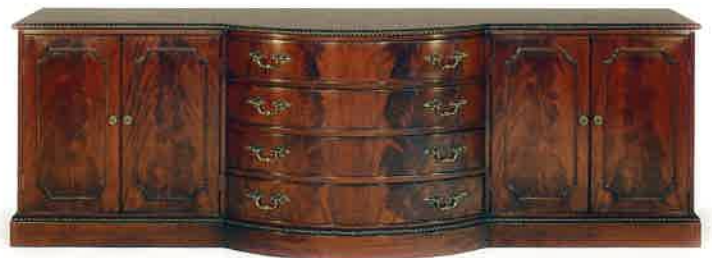
#5069 CHIPPENDALE CABINET WITH BOW FRONT 90"W x 21"D (AT CENTRE) x 29"H Illustrated with mahogany and crotch mahogany faces, Chippendale mouldings and gadroon carving.