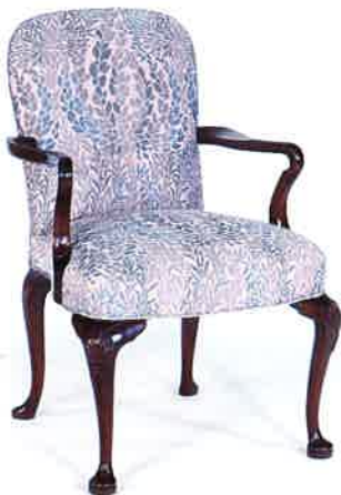
#2172 QUEEN ANNE ARMCHAIR 24" W X 27" D X 37½" H Illustrated in walnut with hand carving on the front legs. Requires 2 yds. of 50" plain fabric.