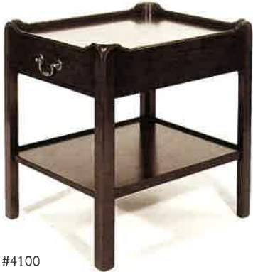
#4100 LAMP TABLE 20"W X 24"D X 25"H Illustrated in mahogany.