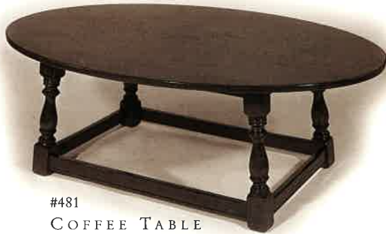
#481 COFFEE TABLE 54"W X 37"D X 19"H Illustrated in oak.