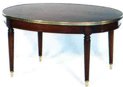
#292 OVAL COFFEE TABLE 36"W X 26"D X 17"H Illustrated in walnut with lip brass edge and brass sabots.