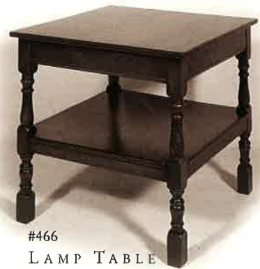
#466 LAMP TABLE 22"W X 22"D X 23"H Illustrated in oak.