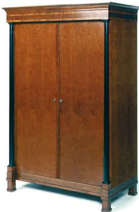
#5018AV BIEDERMEIER AUDIO VISUAL CABINET 48"W X 22"D X 76"H Illustrated in cherry with inlaid borders and ebonized columns.