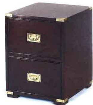
#209 MILITARY CHEST 16"W X 18"D X 21"H Illustrated in mahogany.