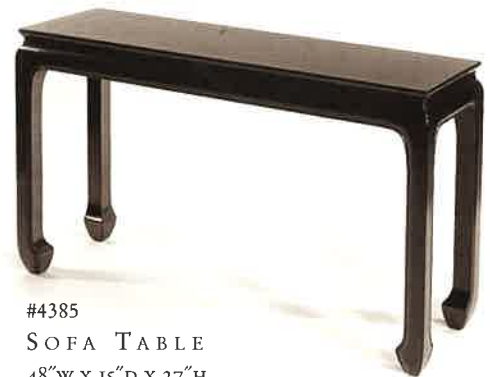
#4385 SOFA TABLE 48"W X 15"D X 27"H Illustrated in ebony polish.