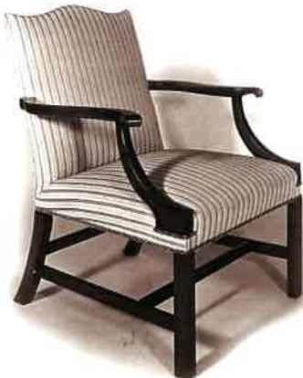
#36 ARMCHAIR 24" W X 27" D X 36" H Illustrated in mahogany. Requires 1¾ yds. of 50" plain fabric.