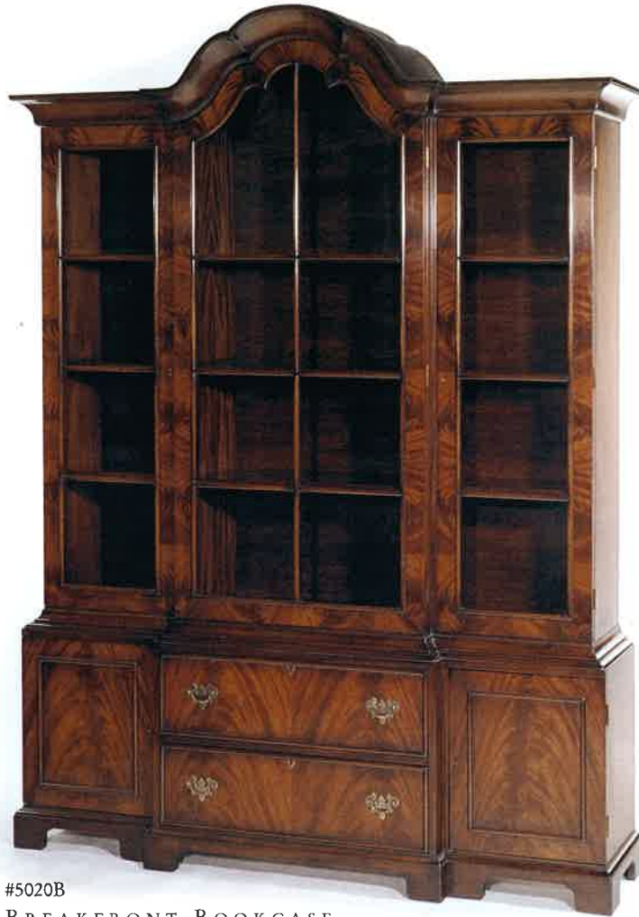
#5020B BREAKFRONT BOOKCASE 66"W X 16½"D X 88"H Illustrated in mahogany with crotch mahogany faces and door frames.