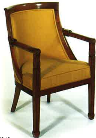
#343 EMPIRE ARMCHAIR 22"W X 22¼"D X 33¾"H Illustrated in mahogany with hand carvings. Requires 2¼ yds. of 50" plain fabric.