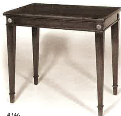
#346 LAMP TABLE 18"W X 26"D X 23"H Illustrated in mahogany with crotch mahogany top.