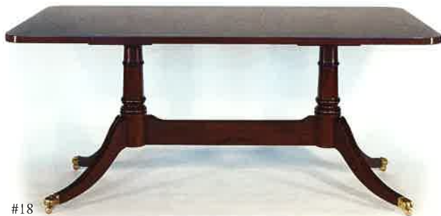
#18 PEDESTAL DESIGN #18 72" L x 36" W x 29 1/2" H Illustrated in mahogany with four sweeps centre stretcher and solid brass lion's claw casters. Can be used as an individual table or multiple sections. The maximum size is 54" x 96" for each section.