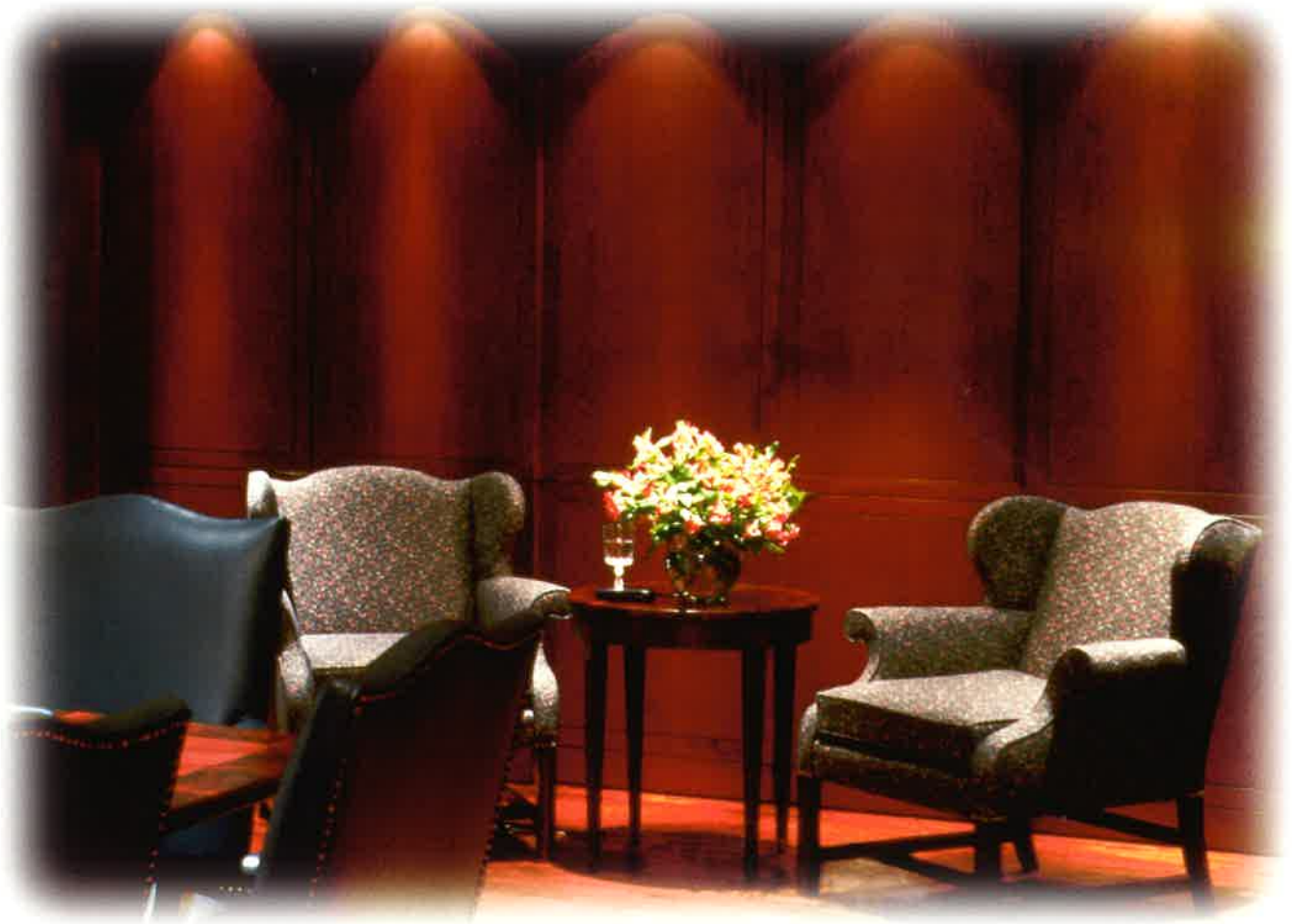
Manulife Financial Head Office