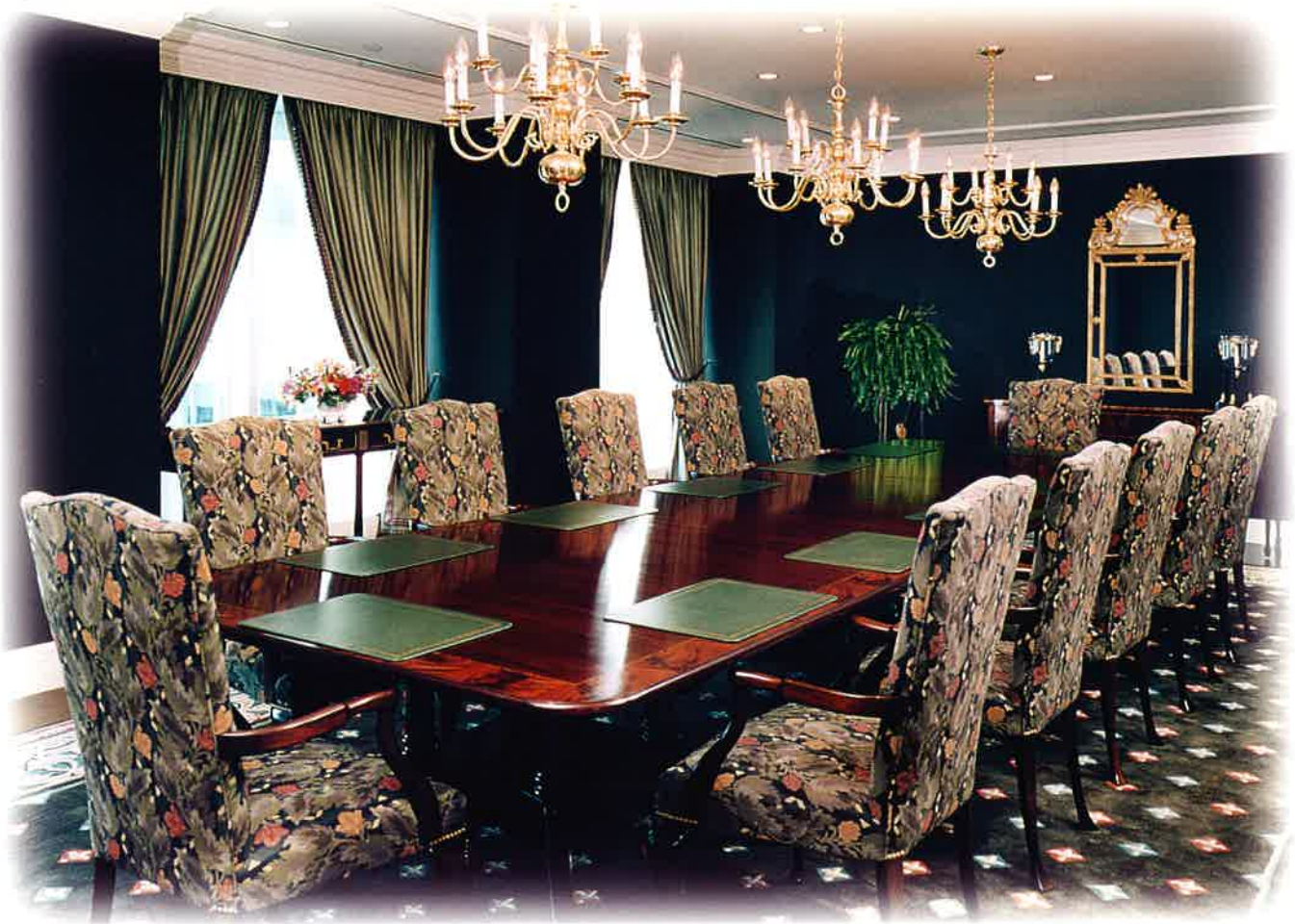
Newcourt Credit Group