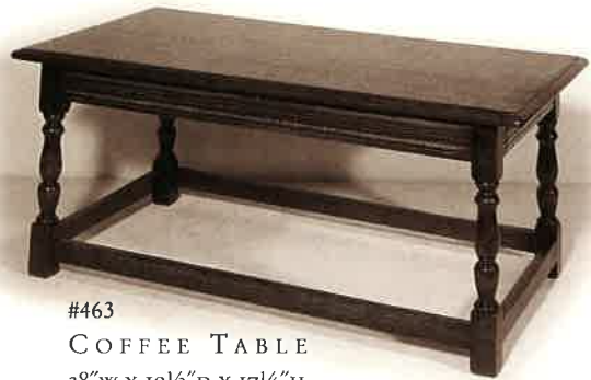
#463 COFFEE TABLE 38"W X 19½"D X 17¼"H Illustrated in oak.