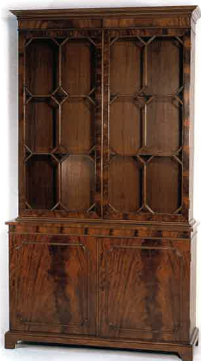
#5086 BOOKCASE 46"W x 16"D x 82"H Illustrated in mahogany with crotch mahogany doors and frieze.