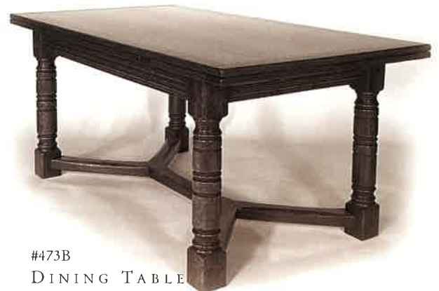
#473B DINING TABLE 66"L X 36"W X 29½"H Illustrated in oak with 18" draw leaf at each end.