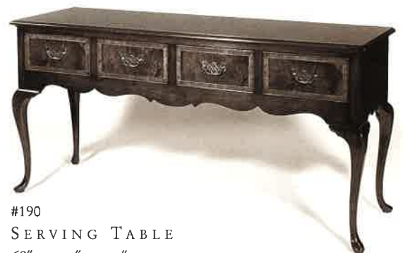
#190 SERVING TABLE 68"W X 21"D X 33"H Illustrated in walnut with burl walnut and inlaid drawer faces.