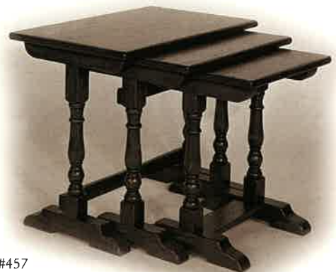
#457 NEST OF TABLES 22"W X 14"D X 19"H Illustrated in oak.