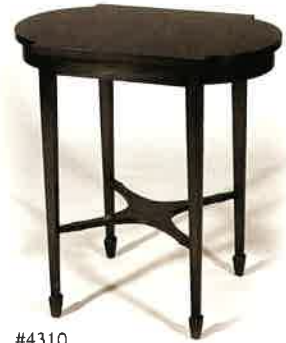
#4310 OCCASIONAL TABLE 25 1/4" W X 16" D X 26" H Illustrated in mahogany.