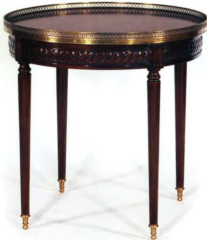
#4375 LAMP TABLE 26" DIA X 25"H Illustrated in mahogany with high brass gallery on edge of top.