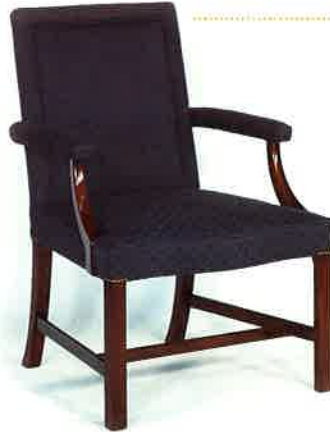
#2181 BOARDROOM ARMCHAIR 26¼" W x 25½" D x 38" H Illustrated in mahogany with upholstered arm. Requires 2½ yds. of 50" plain fabric.