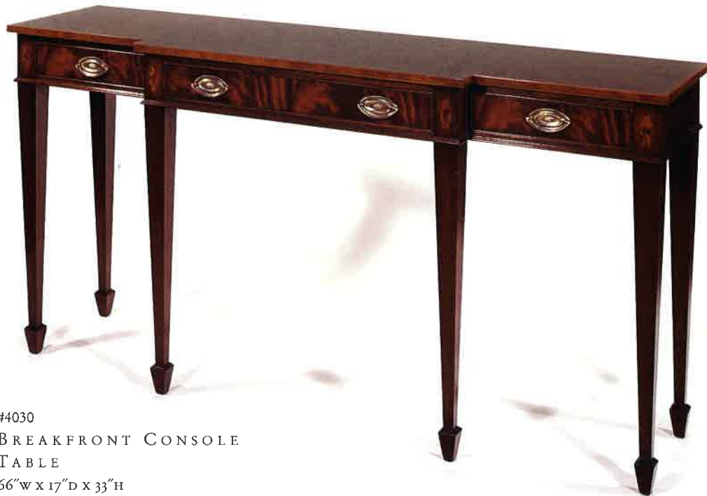
#4030 BREAKFRONT CONSOLE TABLE 66"W x 17"D x 33"H Illustrated in mahogany with crotch mahogany drawer faces and inlaid border on top surface.