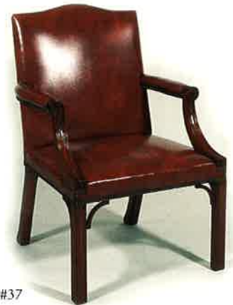
#37 ARMCHAIR 25" W X 26" D X 39" H Illustrated in mahogany with hand carving. Requires 2½ yds. of 50" plain fabric.