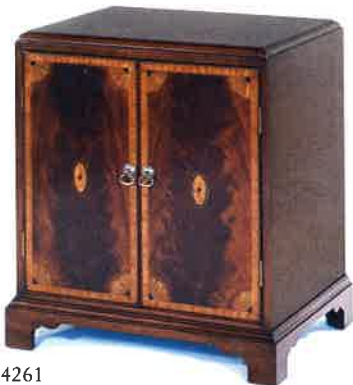
#4261 MINIATURE CHEST 24"W X 18"D X 26"H Illustrated in mahogany with crotch mahogany doors and inlays.