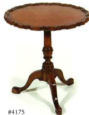
#4175 PEDESTAL TABLE 27"DIA X 27"H Illustrated with carved piecrust edge.