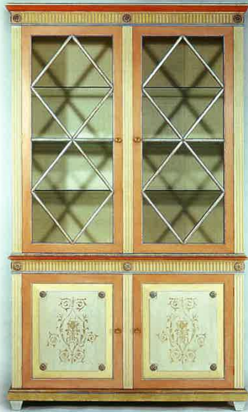
ARMOIRE 54"W x 25"D x 90½"H Illustrated in custom paint finish.