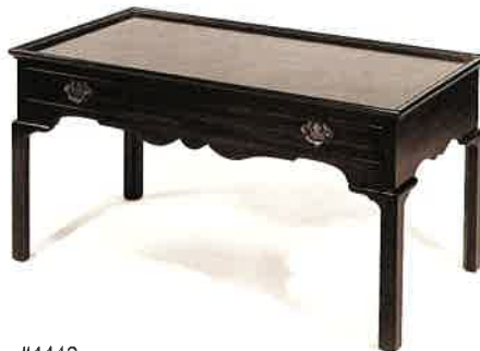
#4440 TEA TABLE 40" W X 20 1/2" D X 20" H Illustrated in mahogany.