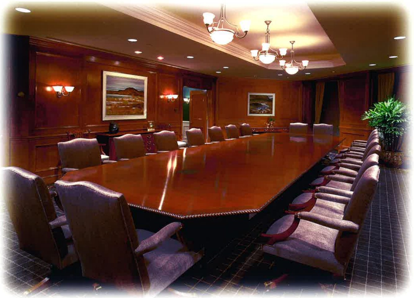
The Molson Companies