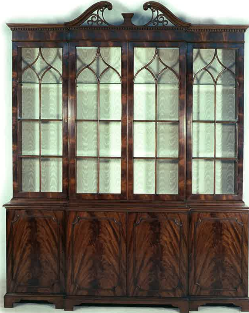
#5011 BREAKFRONT BOOKCASE 72"W x 18"D x 88"H Illustrated in mahogany with curved fret pediment, equipped with lighting and lined back.