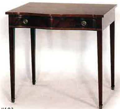
#103 SERPENTINE OCCASIONAL TABLE 29"W x 14"D x 32"H Illustrated in mahogany.