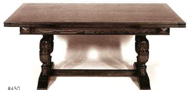
#450 DINING TABLE 72" L x 42" W x 29 1/2" H Illustrated in oak with 21" draw leaf at each end.