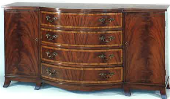
#3127 BOWFRONT SIDEBOARD 66"W x 18"D x 32"H Illustrated with crotch mahogany faces and inlays.