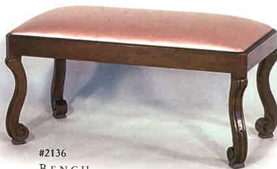
#2136 BENCH 34"W x 16"D x 17 \frac{1}{2} "H Illustrated in walnut. Requires 1 yd. of 50" plain fabric.