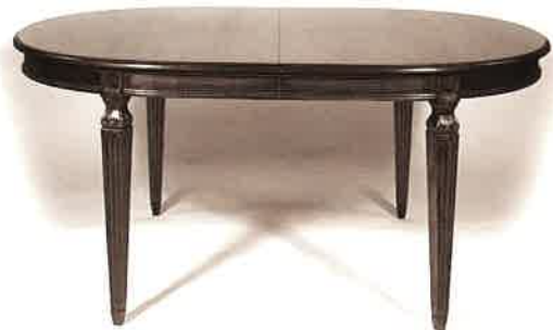
#998 DINING TABLE 66" L x 48" W x 29½" H plus 3 - 18" leaves (leaves not shown) Illustrated in walnut.