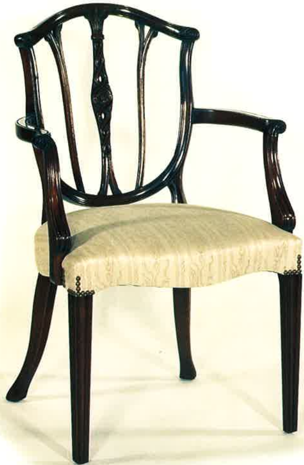
#295 SHIELD BACK ARMCHAIR 22½" W x 19" D x 37" H Illustrated in mahogany with hand carving. Requires ¾ yd. of 50" plain fabric.