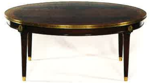
#178 OVAL COFFEE TABLE 39"W X 32"D X 16"H Illustrated in mahogany with four piece crotch mahogany top and yew-wood crossbanding.