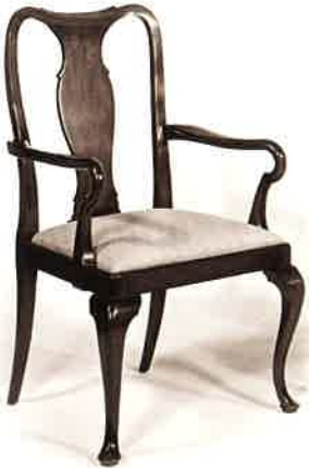
#10 QUEEN ANNE ARMCHAIR 23" W X 23" D X 41½" H Illustrated in mahogany with slip seat. Requires ⅔ yd. of 50" fabric for 2 seats.