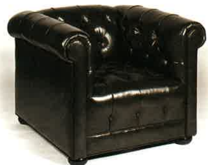
#2520A CLUB CHAIR 36" W x 36½" D x 29" H Illustrated with diamond tufted upholstery. Requires 10½ yds. of 50" wide plain fabric. Seat depth 23".