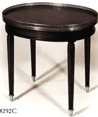
#292C LAMP TABLE 23½"W X 18½"D X 21"H Illustrated in mahogany with high brass gallery on edge of top.