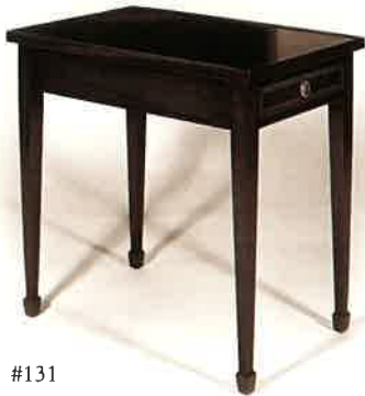
#131 L A M P T A B L E 16"W x 24"D x 23"H Illustrated in mahogany with crotch mahogany top and inlays.