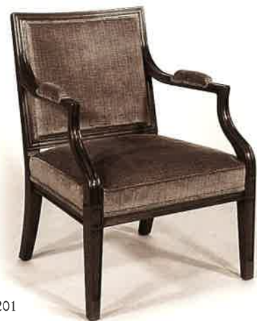
#201 ARMCHAIR 25" W x 25½" D x 34½" H Illustrated in mahogany. Requires 3⅓ yds. of 50" plain fabric.